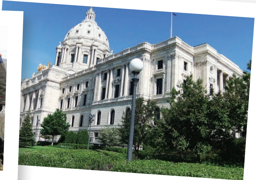
Legislative Report, pages 10 & 11

MINNESOTA North Star Chapter The leading grassroots voice to preserve and protect Minnesota's environment.