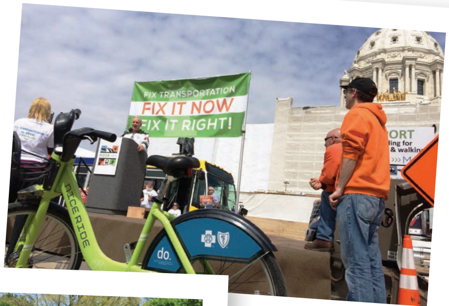
Move MN Rally