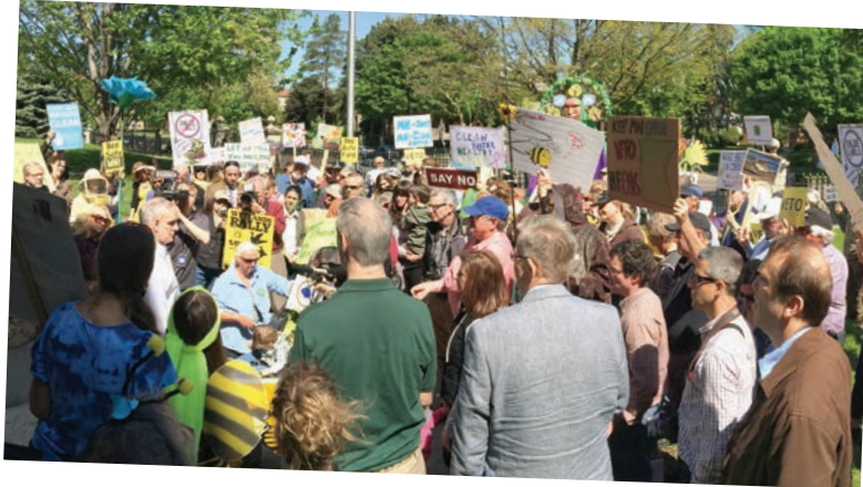
Gathering at Governors Residence May 21