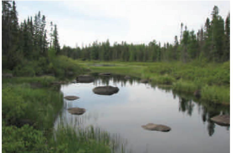
Superior National Forest

The U.S. Forest Service and Minnesota Department of Natural Resources (DNR) are once again proposing a Boundary Waters land exchange. The land exchange proposal would trade approximately 30,000 acres of Superior National Forest land from outside the Boundary Waters Canoe Area Wilderness (BWCAW) for state school trust lands that are within the protected boundaries of the BWCAW. Since revenue from Boundary Waters permits has not been shared with the school trust, the lands are not producing money for the schools.