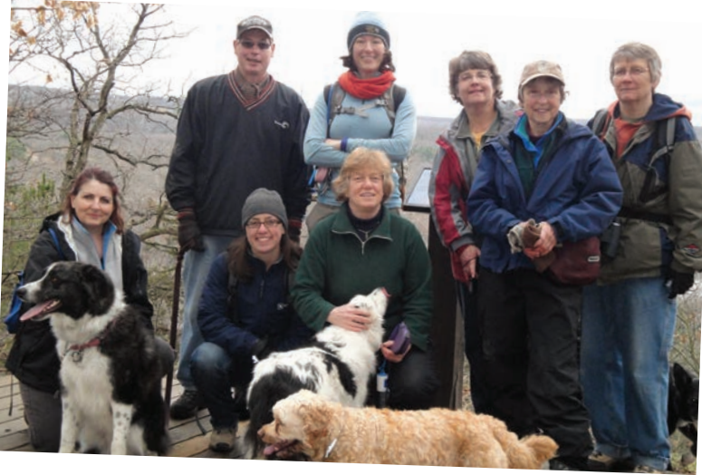
Summer Outings, page 12