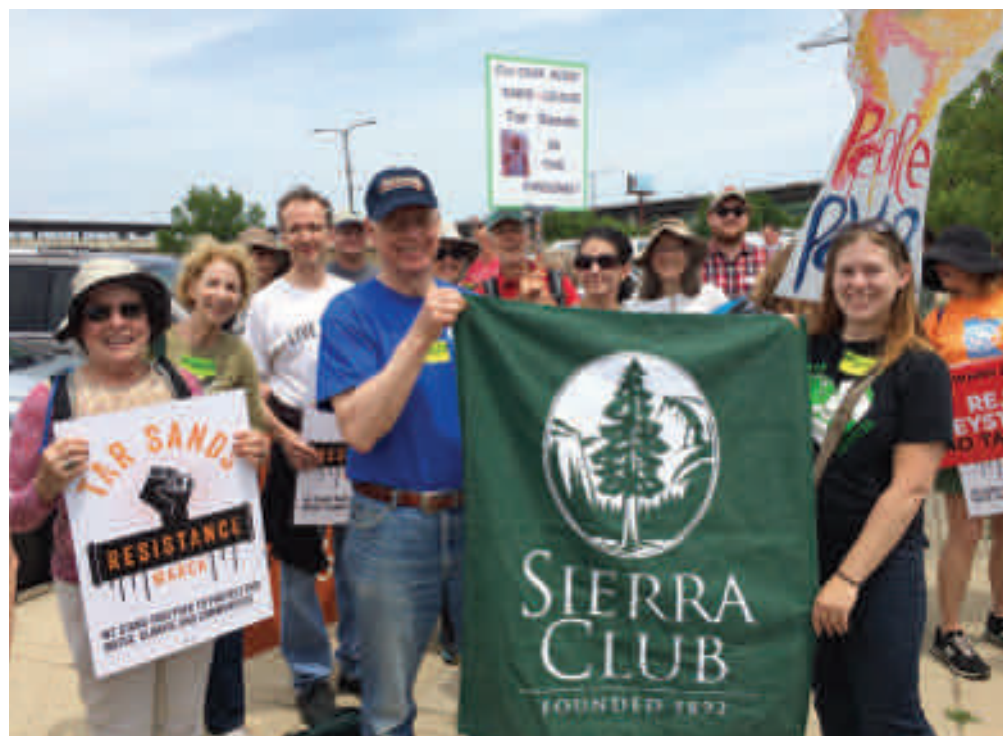
Sierra Club Group - June 6 march