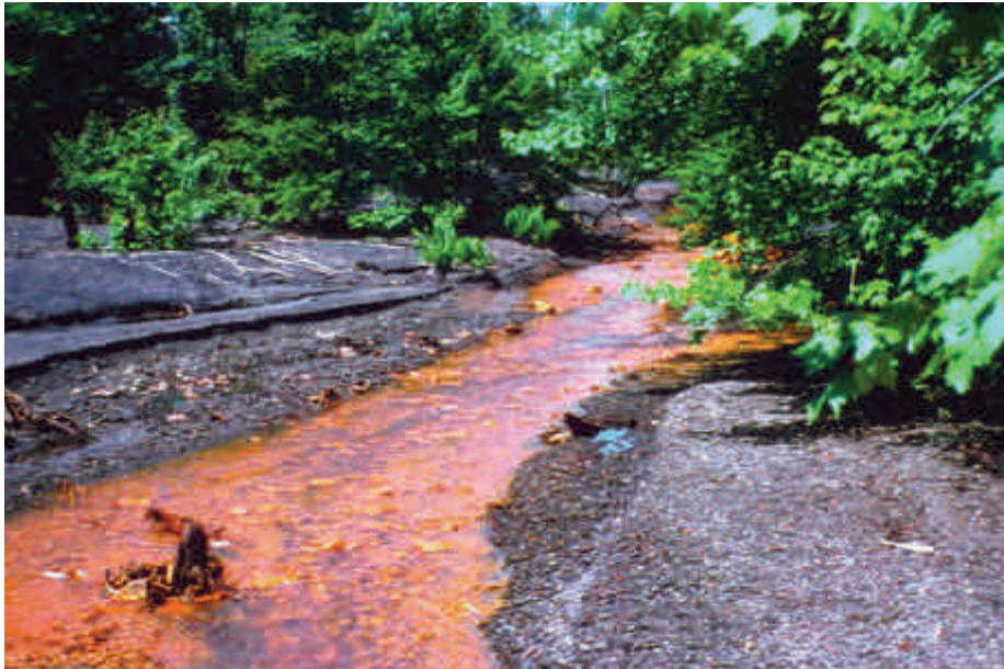
Acid Mine Drainage