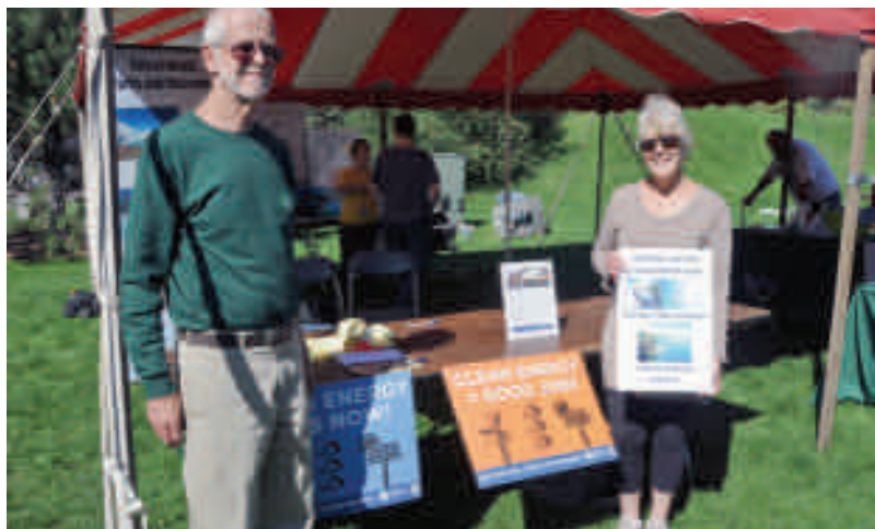
Tabling at Harvest Fest in Duluth.