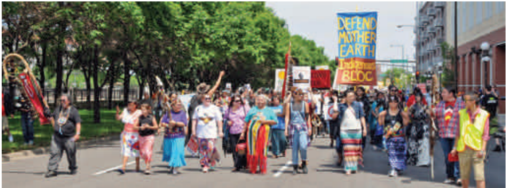
The Indigenous Bloc Leads the March