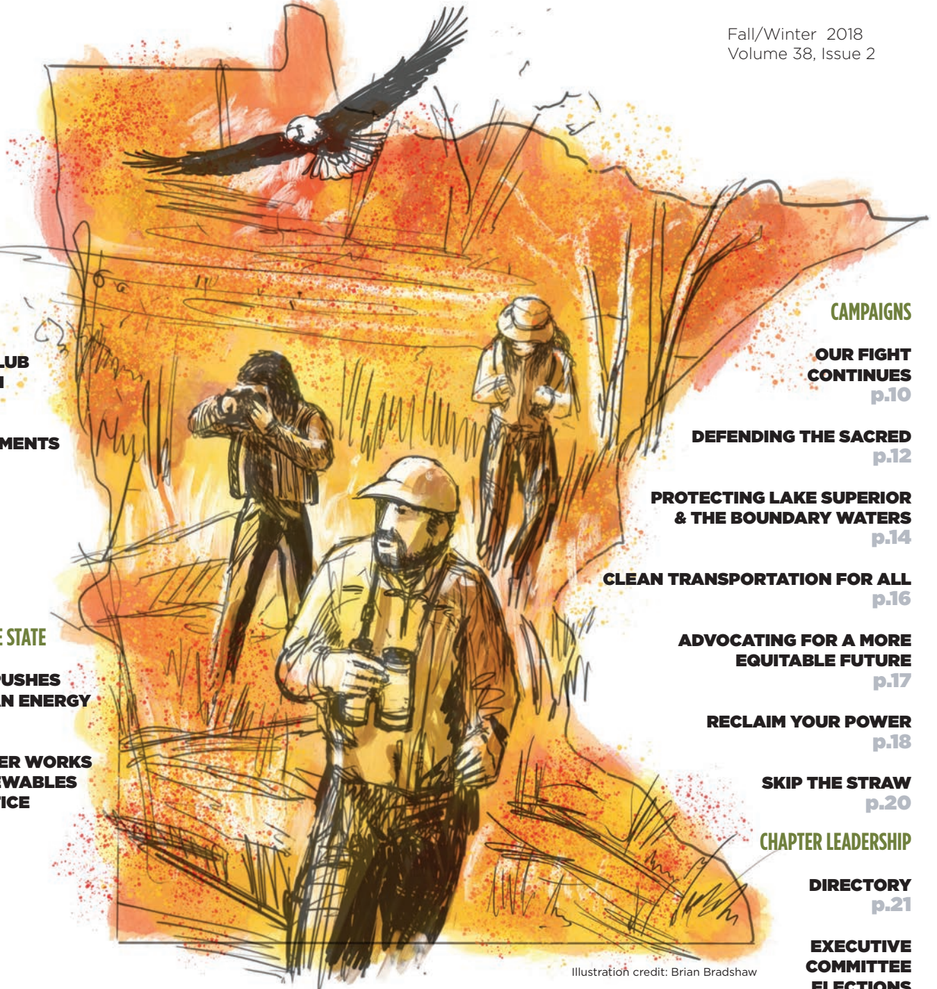
Illustration credit: Brian Bradshaw