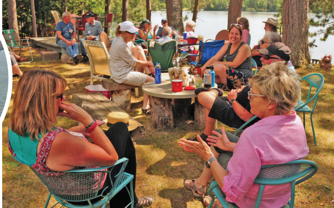
Duluth area Sierra Club members gathered in July.

Besides the hospitality and dedication of our members and volunteer leaders, the thing that has struck me the most in my first 30 days with the Sierra Club is the urgency of this fight. Northeast Minnesota is the hotbed of industry in our state. The climate impacts are hitting us hard and fast up north. It can be hard to focus in the climate fight in Northern Minnesota when multiple sulfide mines, coal plants, natural gas plants, and oil pipelines are all looming and threatening our air and water quality. In this urgency, we continue to focus on growing our movement stronger through collaborative events such as the People's Climate March and coalitions spaces.