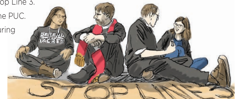
Illustration credit: Brian Bradshaw