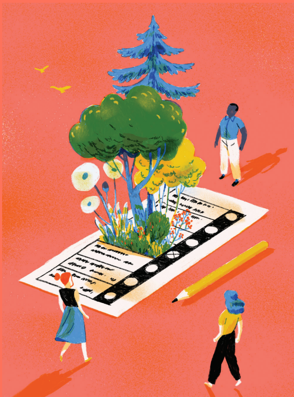
Illustration by Drew Shannon

We have all been living with the consequences of the 2016 election, from sweeping attacks on our public lands to denial of climate change to violation of human rights.