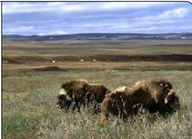
Muskoxen on the arctic coastal plain.