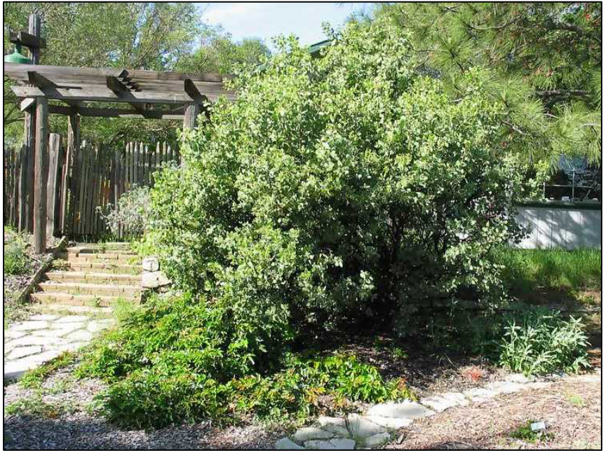
ARCHTOSTAPHYLOS 'DR. HURD' MANZANITA

Just as in the parks and open spaces of a city, gardens and small developed landscapes can also provide food, water, shelter, and nesting sites for birds, butterflies, beneficial insects and other creatures, thus helping to conserve valuable wildlife resources and restore damaged ecosystems. Though we have not yet lost many of the local bird species, their numbers have been drastically reduced. Our ecosystem has been heavily stressed by urban development, having lost so many of our small predators—coyotes, hawks, hogs, and fishers—so that we end up with more rabbits, gophers, and ground squirrels. Creating small spaces or corridors of native habitat, patched together throughout the region, adds up to a great opportunity for encouraging and protecting our native wildlife.