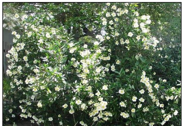
CARPENTERIA CALIFORNICA BUSH IN FULL BLOOM

The stunningly beautiful Tree Anemone is endemic to only seven sites in Fresno and Madera Counties, where it is native to the decomposed granite soil along seasonal creeks between 2500 and 4000 feet, growing amongst the dense chaparral. Extremely popular in European gardens, especially in England, where a cold-tolerant cultivar thrives, this rare native evergreen shrub is now much more common in cultivation than in the wild. Natural seedlings are rare, but the species is well adapted to wildfire, reproducing by stump sprouts after burning. Those who wish to grow this and other native plants in their gardens should only obtain them from commercial nurseries, which have the necessary permits to collect wild seeds on public lands. The permit process is essential in order to make sure that collectors do not negatively impact the population and genetic diversity of our native ecosystems.