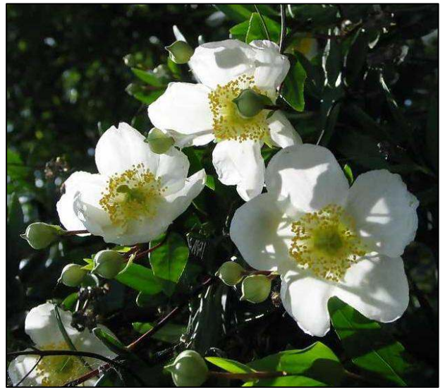
CARPENTERIA CALIFORNICA (BUSH OR TREE ANEMONE)

To learn more go to www.sierrafoothill.org/preserves .