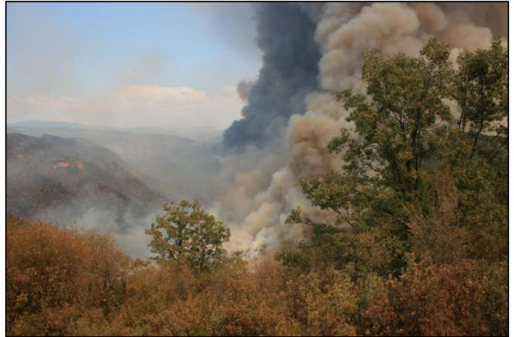
THE RIM FIRE BURNS IN TUOLUMNE RIVER CANYON BELOW YOSEMITE.