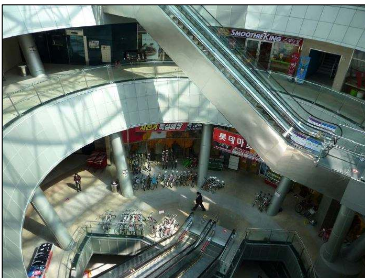
THERE IS NOTHING PARTICULARLY FANCY ABOUT THIS JAPANESE VERTICAL MALL, BUT NOTICE ALL THE BICYCLES PARKED ON THE GROUND FLOOR. OTHER COUNTRIES ARE NOT SO RELIANT ON CARS.