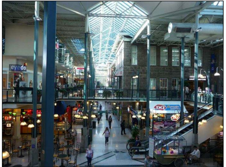
ONCE A STREET, NOW A MALL — THE TREND IN URBAN PLANNING IS TOWARD MORE OF THESE, NOT LESS.

It will also put the there there in downtown Fresno. Now people will have a reason to go to the Mall. The pedestrian axes of Fulton and Mariposa will be full of