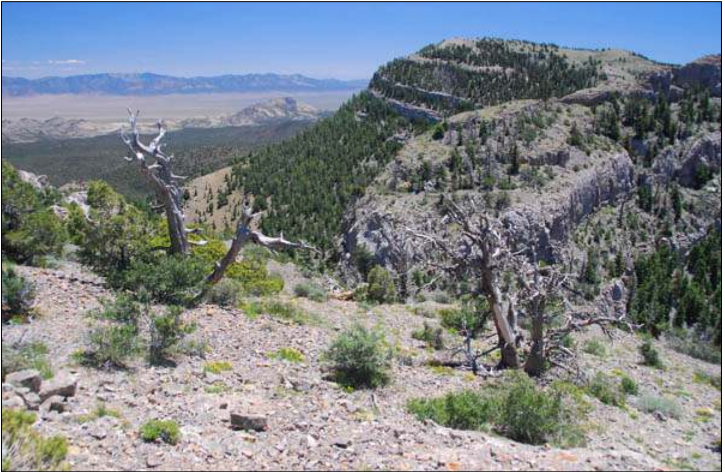
MOUNTAIN HOME RANGE