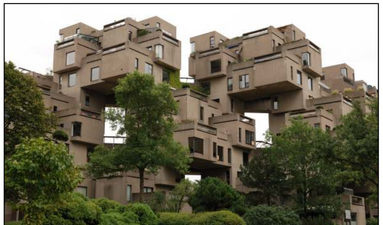
THIS REVOLUTIONARY EXAMPLE OF IMAGINATIVE VERTICAL HIGH-DENSITY HOUSING, BUILT FOR THE 1967 INTERNATIONAL EXPOSITION, IS AN ARCHITECTURAL LANDMARK IN MONTREAL. HABITAT 67 WAS DESIGNED BY ISRAELI-CANADIAN ARCHITECT MOSHE SAFDIE AS HIS MASTER'S THESIS, EMPHASIZING DENSITY, GREENERY, AND INDIVIDUAL PRIVACY.

The key to the success of every outdoor pedestrian mall is that they have destination points that draw people to the area throughout the day and into the night. For the college town it is the campus nearby. For others it is an arena or theater complex, an ice skating rink, a riverfront, or a promenade along a canal. Nearby shops and restaurants open in the daytime, while night clubs and bistros draw people in at night. By itself a