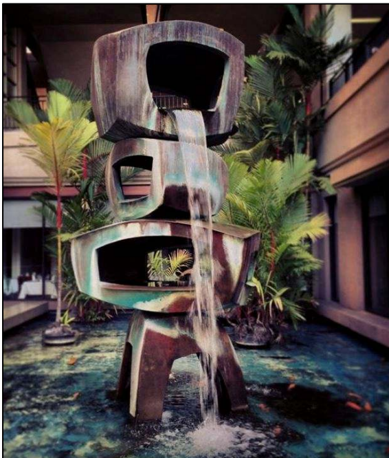
ANY LARGE INTERIOR PUBLIC SPACE WILL BE ADORNED WITH ART, ENHANCING THE TRANSITION FROM INSIDE TO THE ART OUTSIDE ON THE MALL.