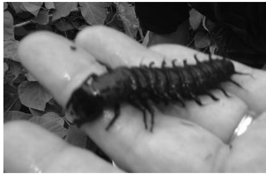
A close-up of just one of the types of aquatic macro – invertebrates (aquatic insects) caught in Harris Creek. By looking at the variety and numbers of these insects as well as fish, the health of a given waterbody can be determined.