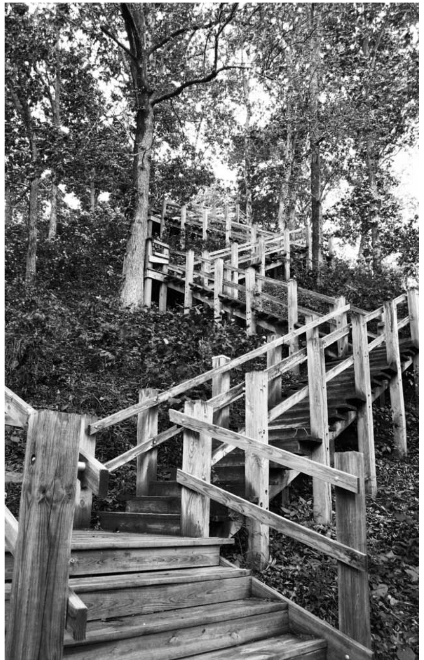
Above: The stairs to climb to the top of Saul Mound. Below: Saul Mound.