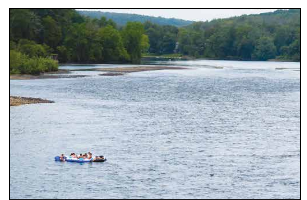
A cleaner Delaware River has made many activities safer and healthier.

New Jersey sought to stop PennEast from condemning land it needed for the pipeline, but the company took its case all the way to the US Supreme Court, which ruled in its favor. Worse yet, President Biden took the side of PennEast, indicating that the federal government has the right to use eminent domain to assist private companies working on projects considered to be in the public interest. The battle continued. Finally, on September 27, 2021, Reuters carried the head-<u>line</u>: "PennEast becomes the latest to scuttle a natural gas pipeline project."