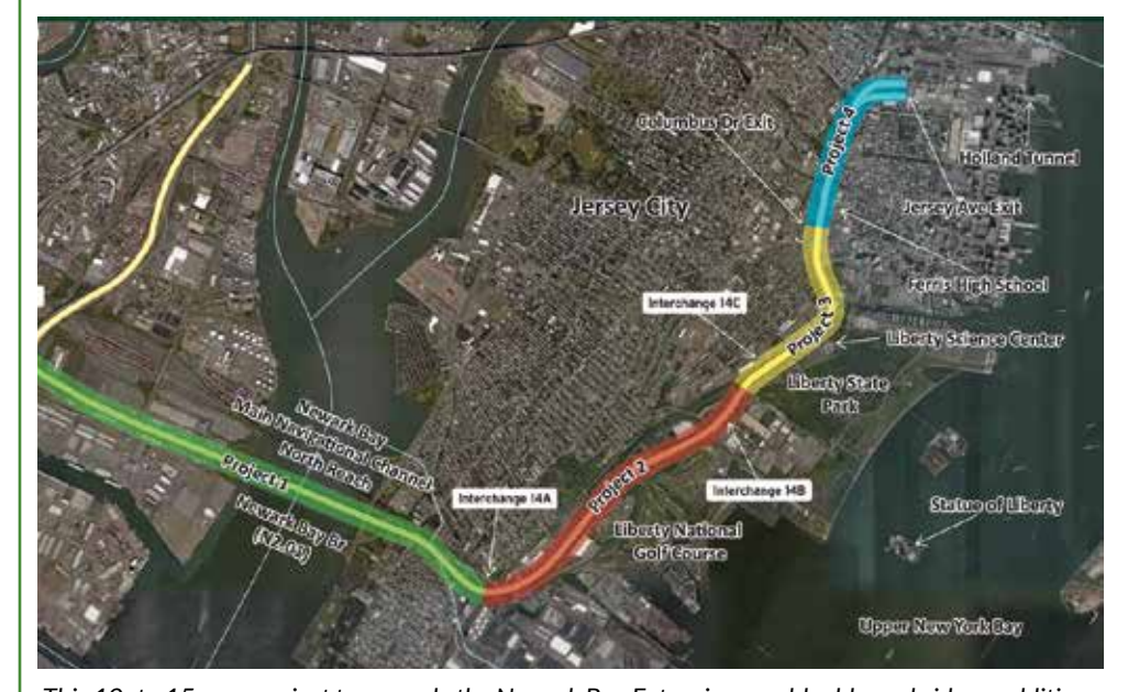
This 10- to 15-year project to upgrade the Newark Bay Extension would add new bridges, additional lanes, and highway shoulders to the 8.1 mile roadway.

Lead contamination from Turnpike cleaning: <a href="https://bit.ly/3lcD4xw">https://bit.ly/3lcD4xw</a>