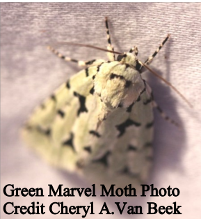
Green Marvel Moth

Sounding like a comic book superhero, and its wing pattern reminding me of a marble composition notebook, my favorite that night was Green Marvel.