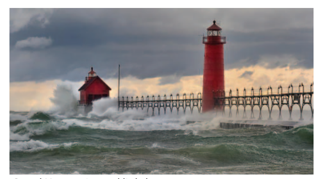
Grand Haven pier and lighthouse.

Responding to pressure from local activists, less than a year later the City Council unanimously approved the establishment of a Sustainability and Energy Committee. One month later, the appointed committee of nearly a dozen individuals including Sierra Club members came together for its first official meeting to chart a course to move Grand Haven to a sustainable future.