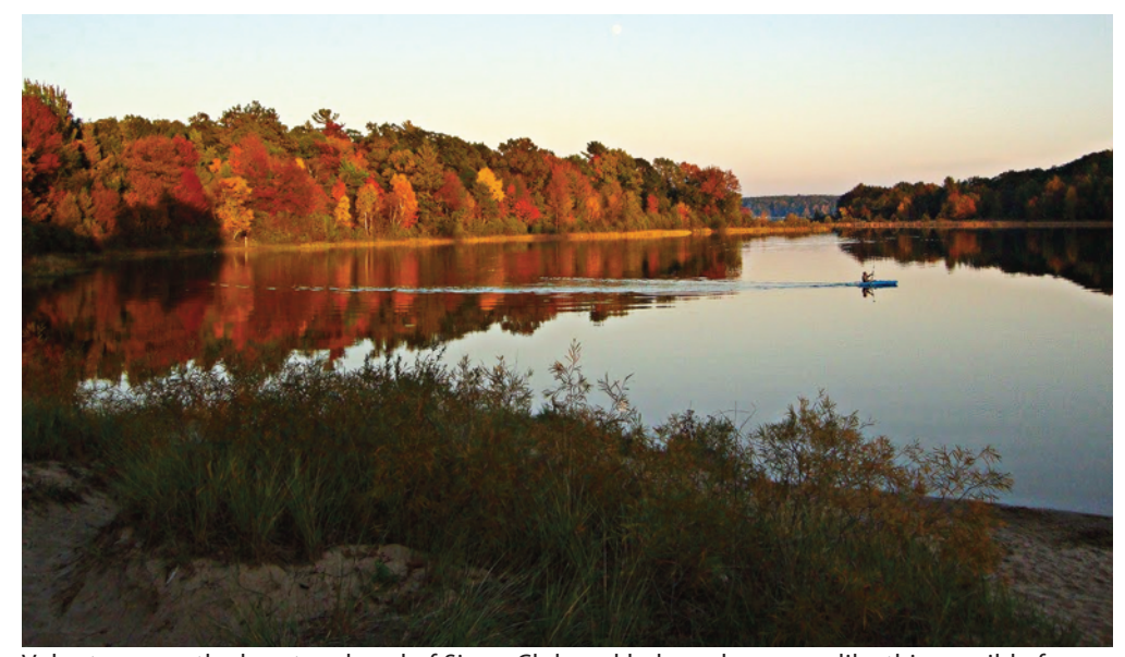
Volunteers are the heart and soul of Sierra Club and help make scenes like this possible for Michigan residents.

But there is no need to wait until election day to act. Right now, Sierra Club staff and volunteers are dramatically moving the needle. Michigan's utilities are being forced to shut down coalburning plants many years earlier than planned, thanks to the Beyond Coal Campaign. Green infrastructure is expanding in our