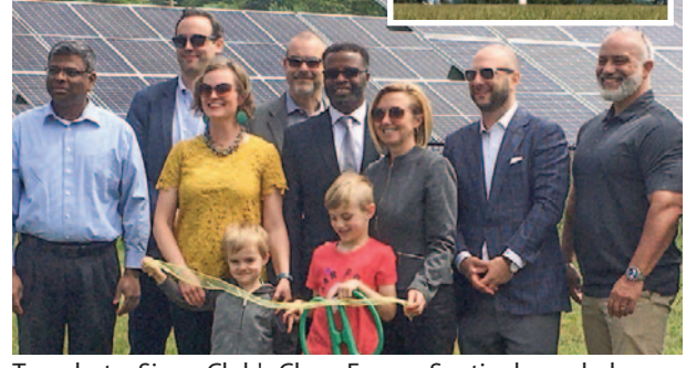
Top photo: Sierra Club's Clean Energy Sentinels can help make projects like the new Montcalm Wind Project outside of Carson City Michigan a reality. Bottom Photo: Grand Rapids Mayor Rosalynn Bliss at the city's three-acre solar array at the city's Water Filtration Plant, another example of the projects that Clean Energy Sentinels can work on.

There are various activities you can be involved in, including some right from your own home. Small acts add up! Volunteering to become a Clean Energy Sentinel can fit in with your time constraints and talents because the Michigan Chapter works at many levels to fight global warming. Join this important effort today!