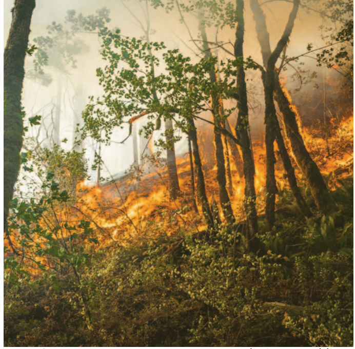
Forest fires like this one near Portland are a distinct possiblity in Michigan.

Beech trees are susceptible to Beech Bark Disease spread by insects. Warming winters have lengthened the active season for these insects which makes are the self-trees disease.