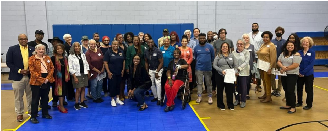
Participants at Environmental Justice and You: Energy and Equity at District Heights Municipal Center, Nov. 5, 2022.