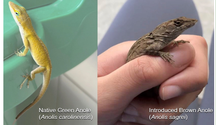
Native Green Anole ( Anolis carolinensis )