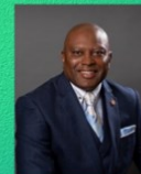
Orlando Guides For City Council, Dist. 5