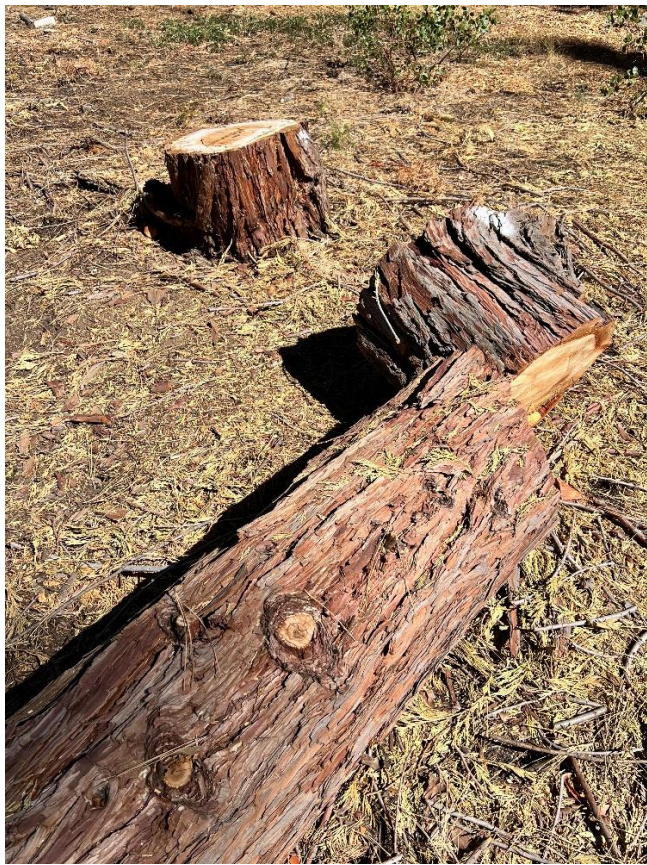
Damages to terrain left by heavy equipment