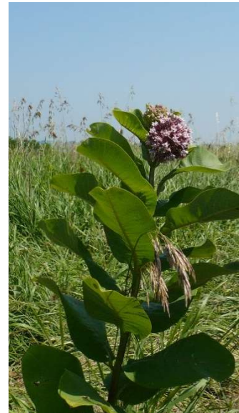
Common milkweed, a favorite of Monarch butterflies.