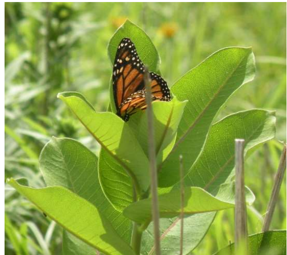
An adult Monarch butterfly and common milkweed.