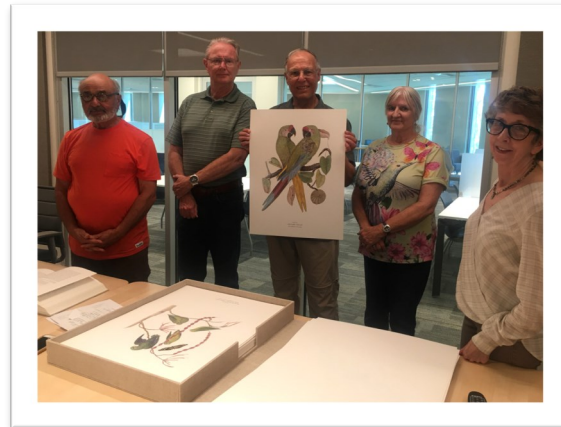
VASCHÉ LIBRARY, GRAYSON BOOKS August 2, 2023