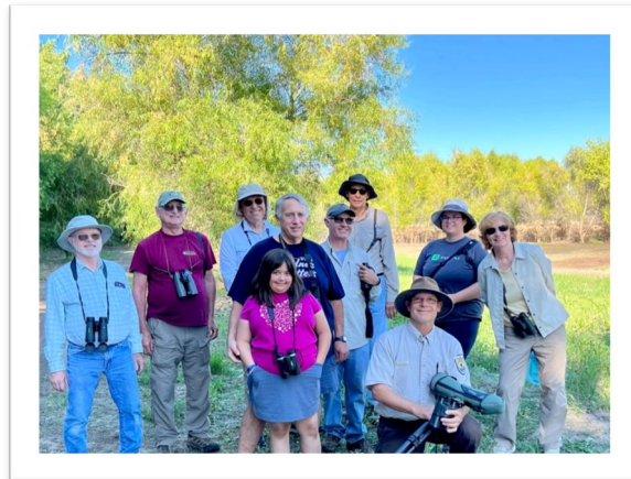
SAN JOAQUIN RIVER N.W.R. July 15, 2023