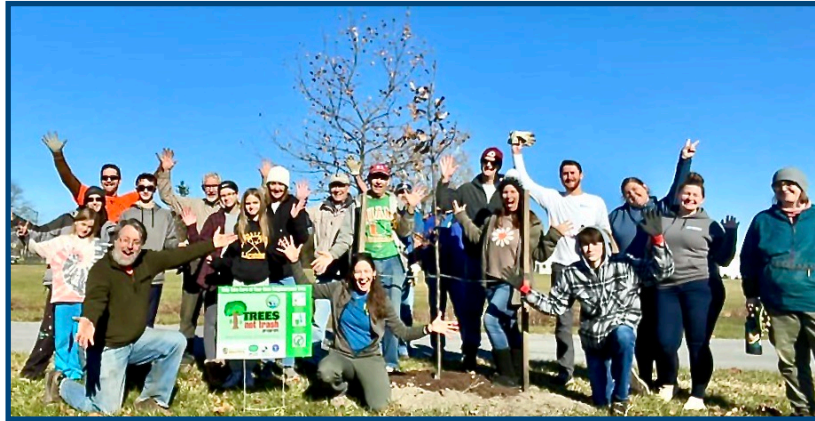
Antietam-Conococheague Watershed Alliance - ACWA

Conococheague Watershed Alliance (ACWA) has organized several seed collections this year. The one remaining is in the list below.