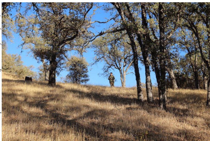
Enjoying Molok Luyuk

As a coalition of environmental groups settled in to fashion a long term campaign plan to promote HR 6366, we got a pleasant surprise, when on February 25 the Ukiah Field Office of the Bureau of Land Management (BLM) definitively rejected the latest in a series of ill-advised wind energy proposals that sought to install dozens of huge turbines in this sensitive area.