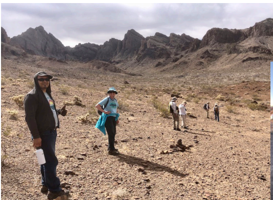
Maintaining the "Mexican Hat" trail in Turtle Mts Wilderness -- which our volunteers had helped design years ago