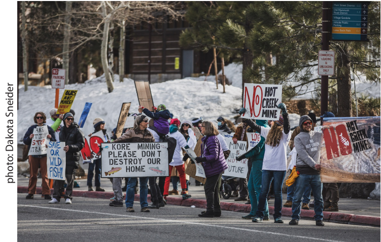
Protest on Minaret Road

(from a press release from the Conglomerate Mesa Coalition, dated March 18, 2022. Sierra Club is a member of the Coalition.) (See WOW Aug 2021, April & Dec 2020, Aug 2018, Dec 2017) ☞