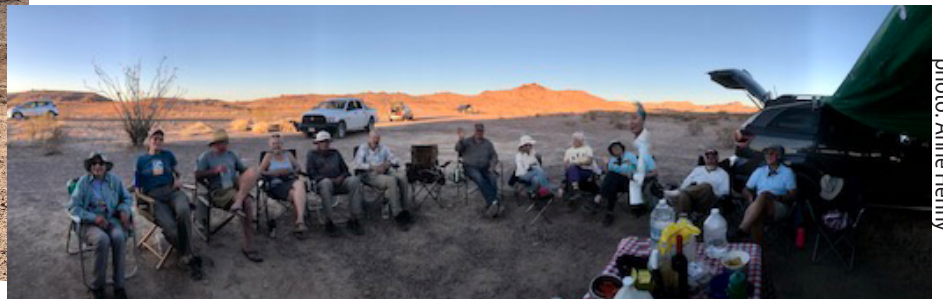
In camp at Snaggletooth