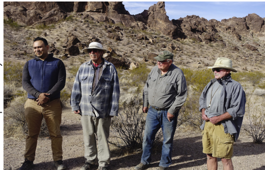
Desert volunteers get work instructions