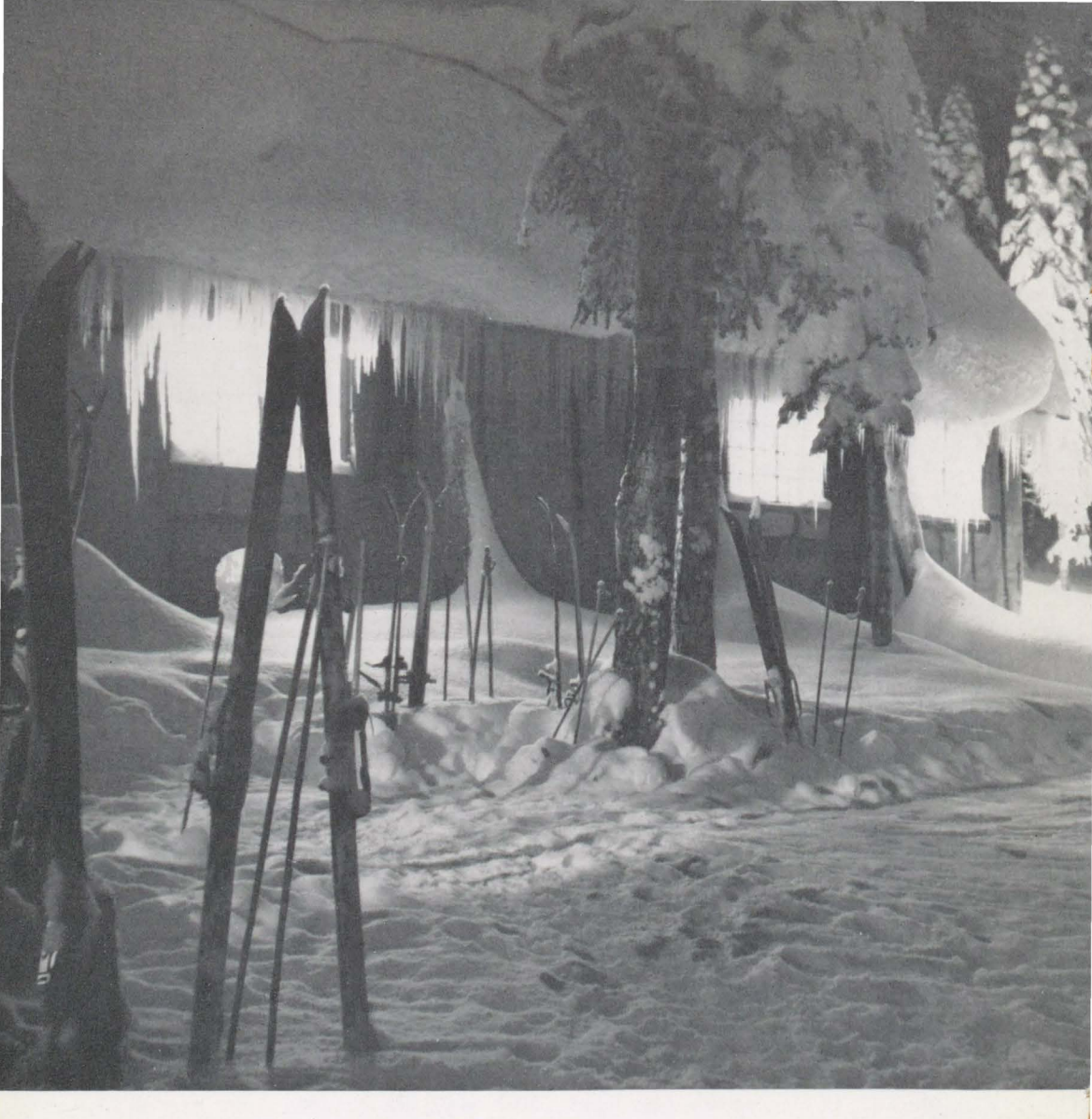
WINTER EVENING, CLAIR TAPPAAN LODGE