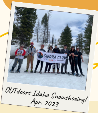
OUTdoors Idaho Snowshoeing! Apr. 2023