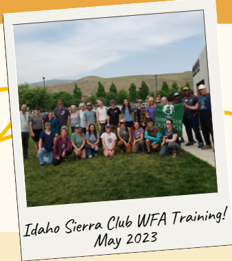
Idaho Sierra Club WFA Training! May 2023