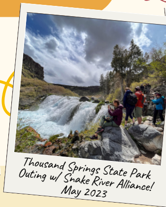
Thousand Springs State Park Outing w/ Snake River Alliance! May 2023