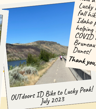
OUTdoors ID Bike to Lucky Peak! July 2023