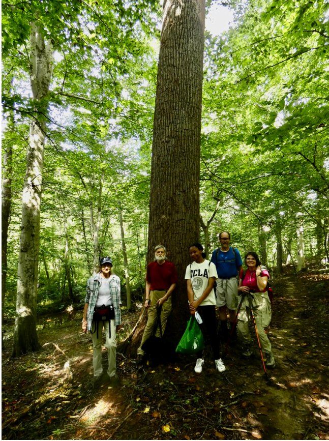
Outings participants enjoy the shade of a large tulip tulip tree in Watkins Park in August