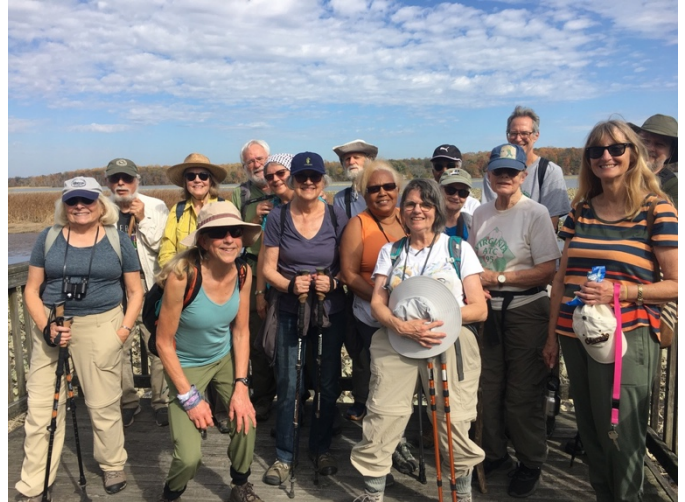
The view from the observation deck at Jug Bay Natural Area never disappoints