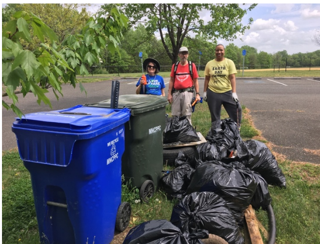
PGSC volunteers participate in Growing Green with Pride with trash pick-up at Oak Creek West Park