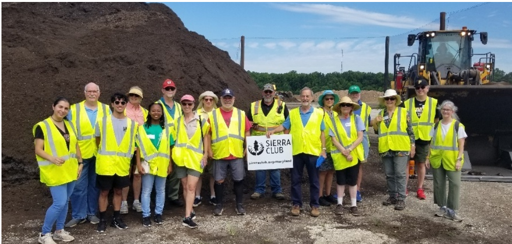
Tours of Organics Composting Facility, July 2023 and Ritchie Land Reclamation Landfill, August 2023

The Zero Waste team met virtually each monthly. We hosted educational tours of the Materials Recycling Facility, the Organics Composting Facility, the Brown Station Road Sanitary Landfill, and the Ritchie Land Reclamation Landfill, and participated with SWAC in a tour of TurboHaul Mattress Recycling. We also monitored the roll out of the food service accessories “on request” bill, continued tracking of synthetic turf fields for statewide legislation, collaborating with the Solid Waste Advisory Commission, and laid the groundwork for a future event on illegal dumping, and updated the website. We also contributed to mass emails about reduction of plastic waste and expansion of the County’s curbside composting program to augment publicity about the curbside compost pickup program for unincorporated areas and supported the efforts toward composting programs in municipalities.