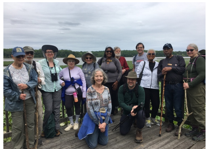
Outings participants enjoy the view of the Patuxent River