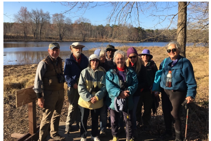
Cash Lake at Patuxent Research Refuge, North Tract