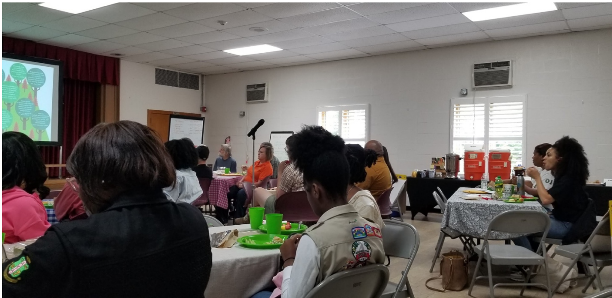
Participants at Environmental Justice and You: Tree Equity at Gethsemane United Methodist Church in Capitol Heights listen to a presentation about the role of trees in addressing the problem of climate change.