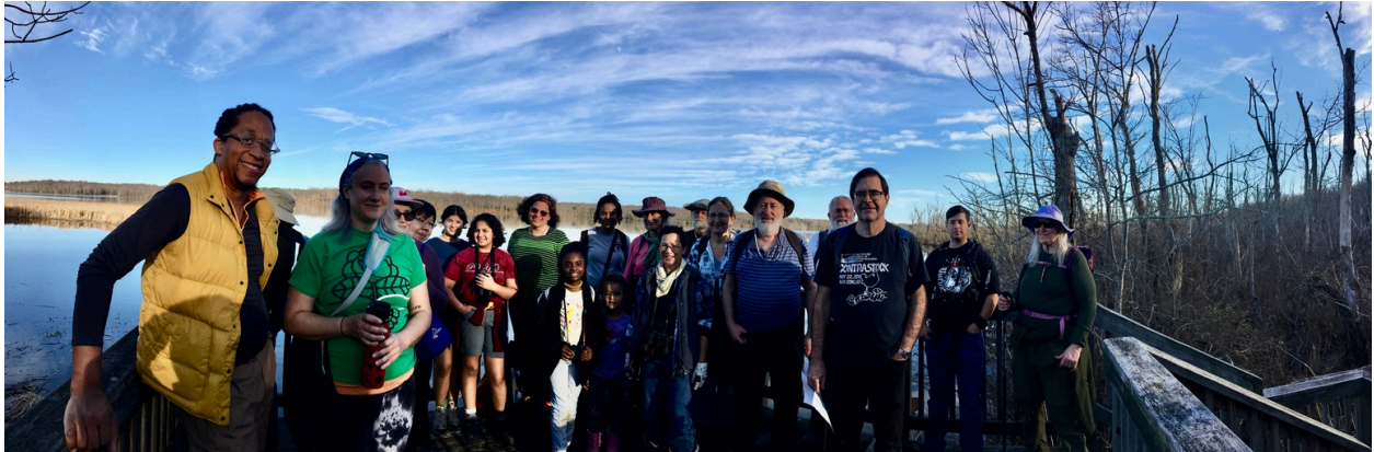
First Day Hike at Jug Bay Natural Area

The PGSC Outings team started 2023 with a goal to have an outing each month. While two scheduled outings got rained out, we led 10 hikes, two service outings, and 2 outings leader training sessions. We also participated in training for measuring big trees and removing invasive vines. We welcomed two new provisional outings leaders to the team and look forward to their certification in 2024.