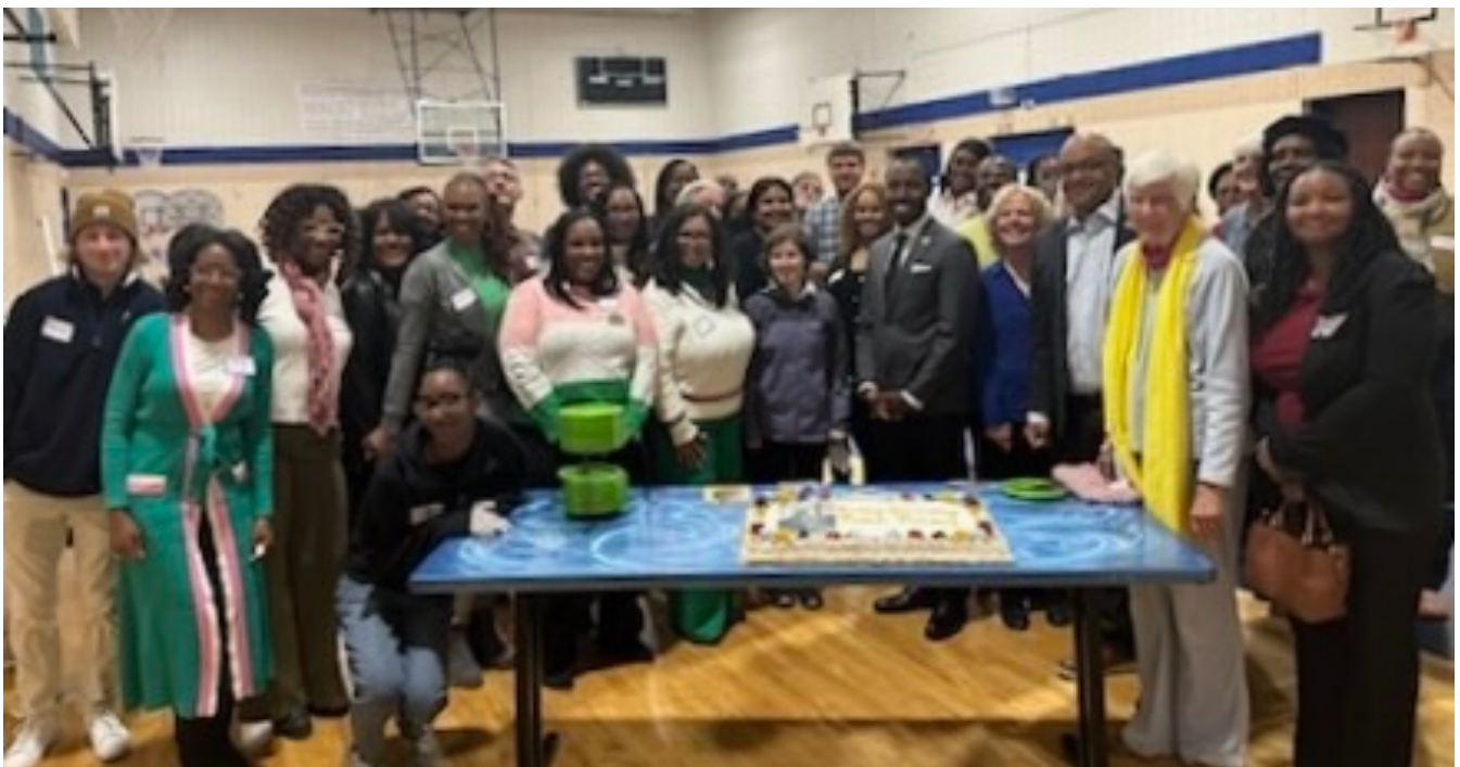
Alpha Kappa Alpha joins Sierra Club for Transit Equity Day celebration