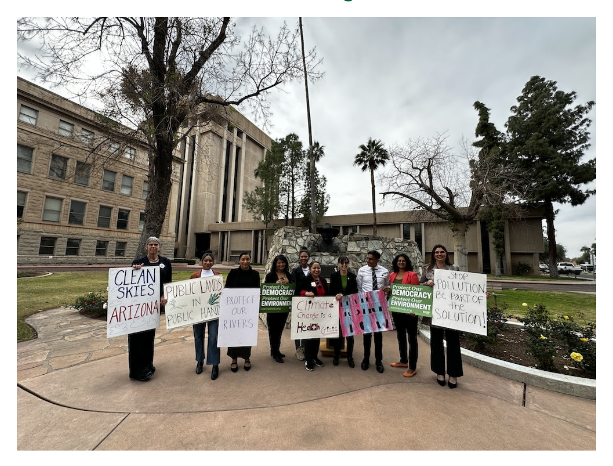
Announcing our 2024 Arizona Legislative Priorities.