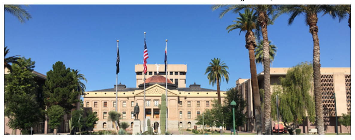
Historic Capitol