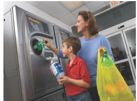
A reverse vending machine

The program would be operated by a nonprofit Beverage Container Stewardship Organization selected by the Maryland Department of the Environment (MDE), representing all producers that sell beverages in the state. MDE would provide substantial oversight, approving stewardship plans and annual reports, and setting the programs' convenience standards and handling fees for redemption points. An Advisory Council of stakeholders would advise MDE on plan approval, implementation, and performance.