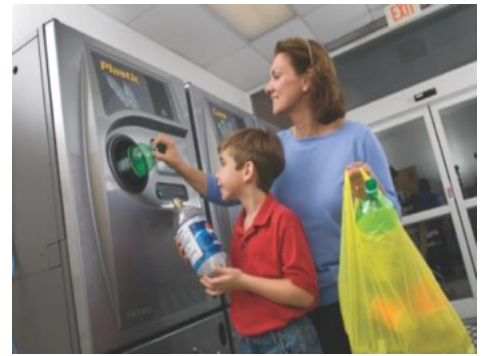
A reverse vending machine

The program would be operated by a nonprofit Beverage Container Stewardship Organization selected by the Maryland Department of the Environment (MDE), representing all producers that sell beverages in the state. MDE would provide substantial oversight, approving stewardship plans and annual reports, and setting the programs' convenience standards and handling fees for redemption points. An Advisory Council of stakeholders would advise MDE on plan approval, implementation, and performance.