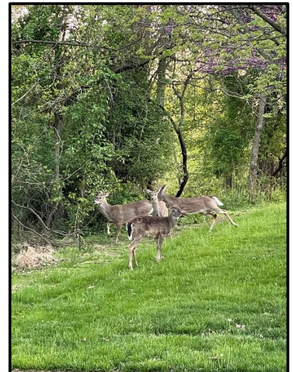
Pat Soffen leads the group on the Cascade Falls Trail in Patapsco State Park (left). White-Tailed Deer in Rockburn Park (right).