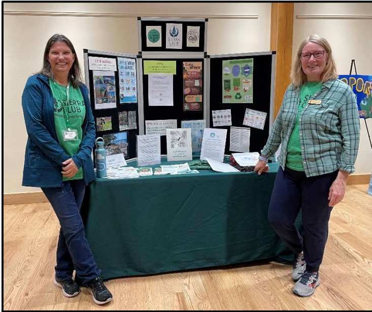
Youth Climate Event