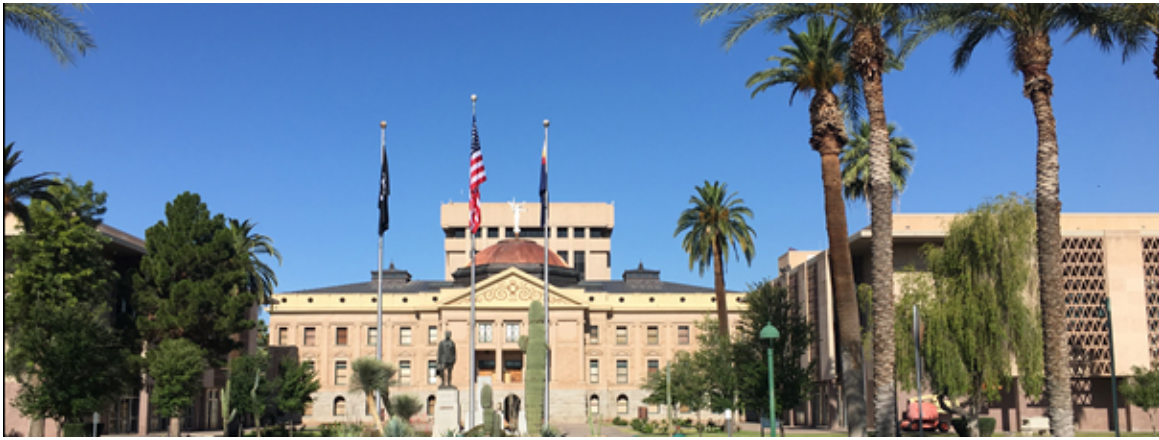
Historic Capitol