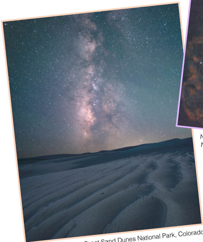
Milky Way from the Great Sand Dunes National Park, Colorado

sierraclub.org/wisconsin/southeast-gateway