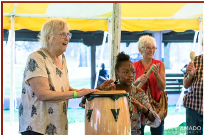
Family Reunion Music Festival