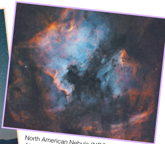
North American Nebula (NGC7000) & Pelican Nebula (IC5070) in the Cygnus Constellation

Left: from our Vacation Night slide show.