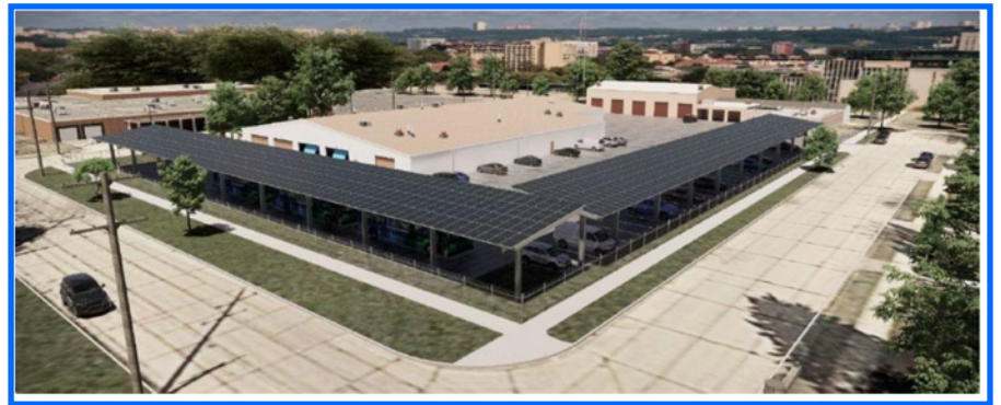
Rendering of the solar array.

“We live in great times in that the federal government is now committed to local government and making sure that we have built infrastructure that meets our needs,”