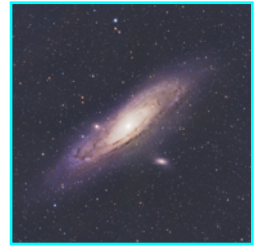
Andromeda Galaxy (M31) in the Andromeda Constellation