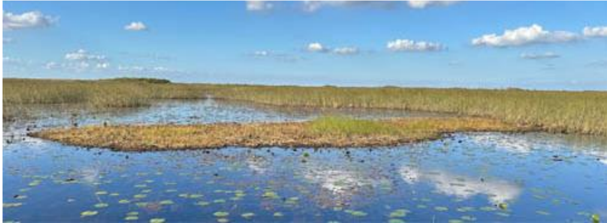
The Everglades

Everglades Restoration at 25 Years: What Still Needs to be Done and Why?