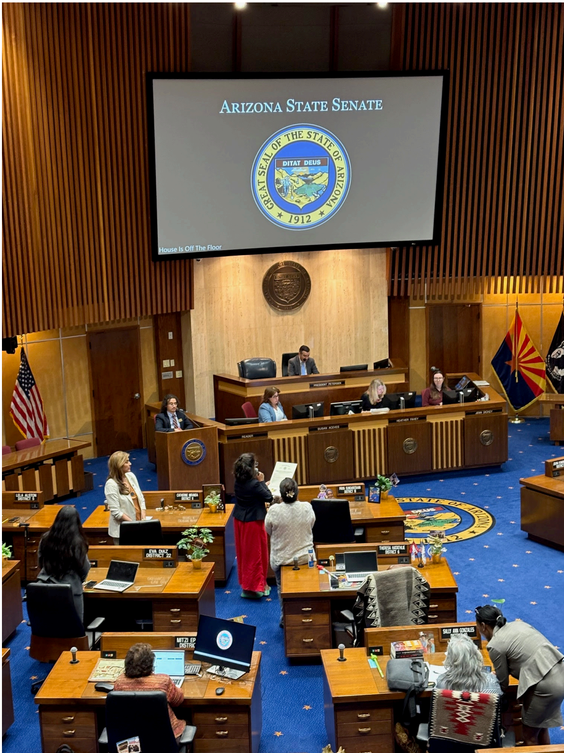
Senator Priya Sundareshan reading a Lobo Week Proclamation on the Senate Floor