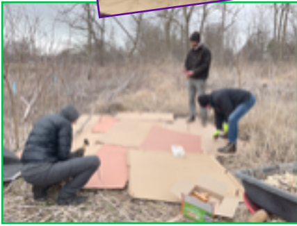
Weed Out! Racine volunteers use cardboard to smother reed canary grass

We are rebuilding the flora because the emerald ash borer killed the ash trees – 40% of the canopy in lower Colonial. Planting native trees, shrubs and forbs, while at the same time removing invasive ones, is essential for recreating a functional ecosystem. Volunteers control garlic mustard, dame's rocket, catchweed bedstraw, thistles, burdock, motherwort and others by pulling, digging, and target spraying them. Reed canary grass (RCG) is another story; it has a dense root system that defies pulling and digging. We need professional knowledge and equipment. A grant from Sierra's Wisconsin Chapter helped pay for some removal work this past summer. We have a grant from the DNR that will allow to control RCG in much of lower Colonial this summer.