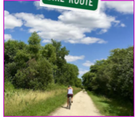
White River State Trail