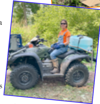
Controlling reed canary grass requires professional know-how and equipment