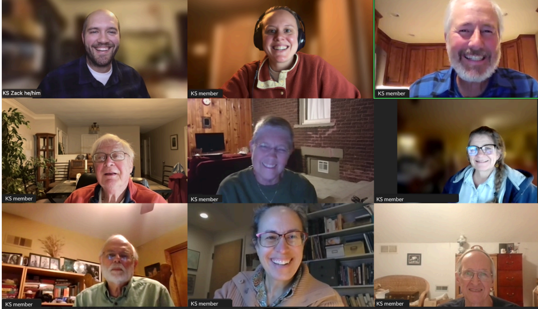
Legislative Committee meeting over Zoom