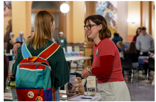
Sierra Club Kansas Chapter volunteers and staff at WEALTH Day