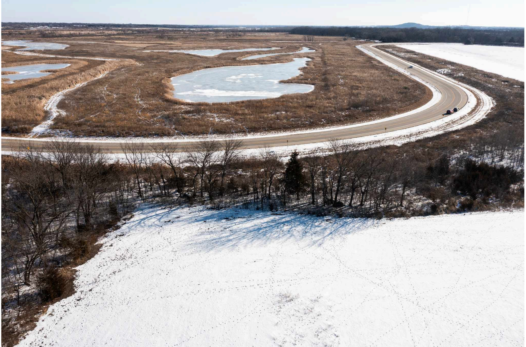
Drone capture of animal tracks on proposed development location

Tell Lawrence City Commissioners to Protect the Wakarusa Wetlands and vote "NO" on the amendment to the comprehensive plan (AMDT-25-0006) that would allow the development of floodplain for a project called Ten59, a 178 acre commercial complex that could include hotels,