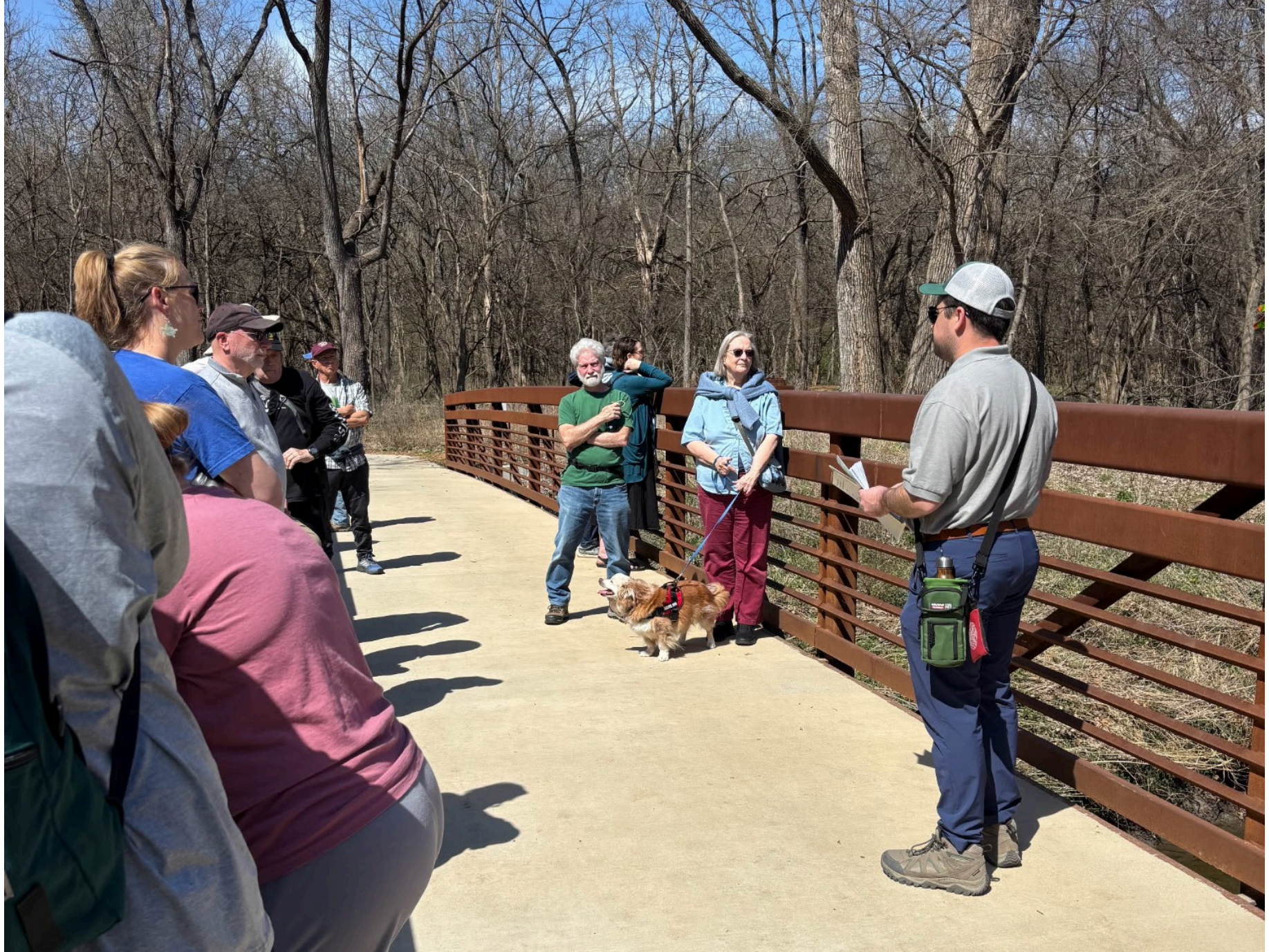
Kanza Network Walk & Talk event at Wolf Creek discussing Blue River conservation | Photo courtesy of Bill Roush