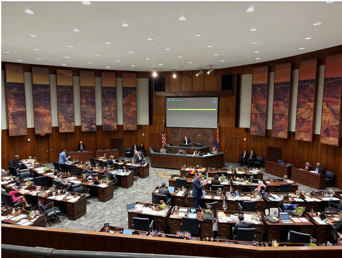
Floor of the Arizona House