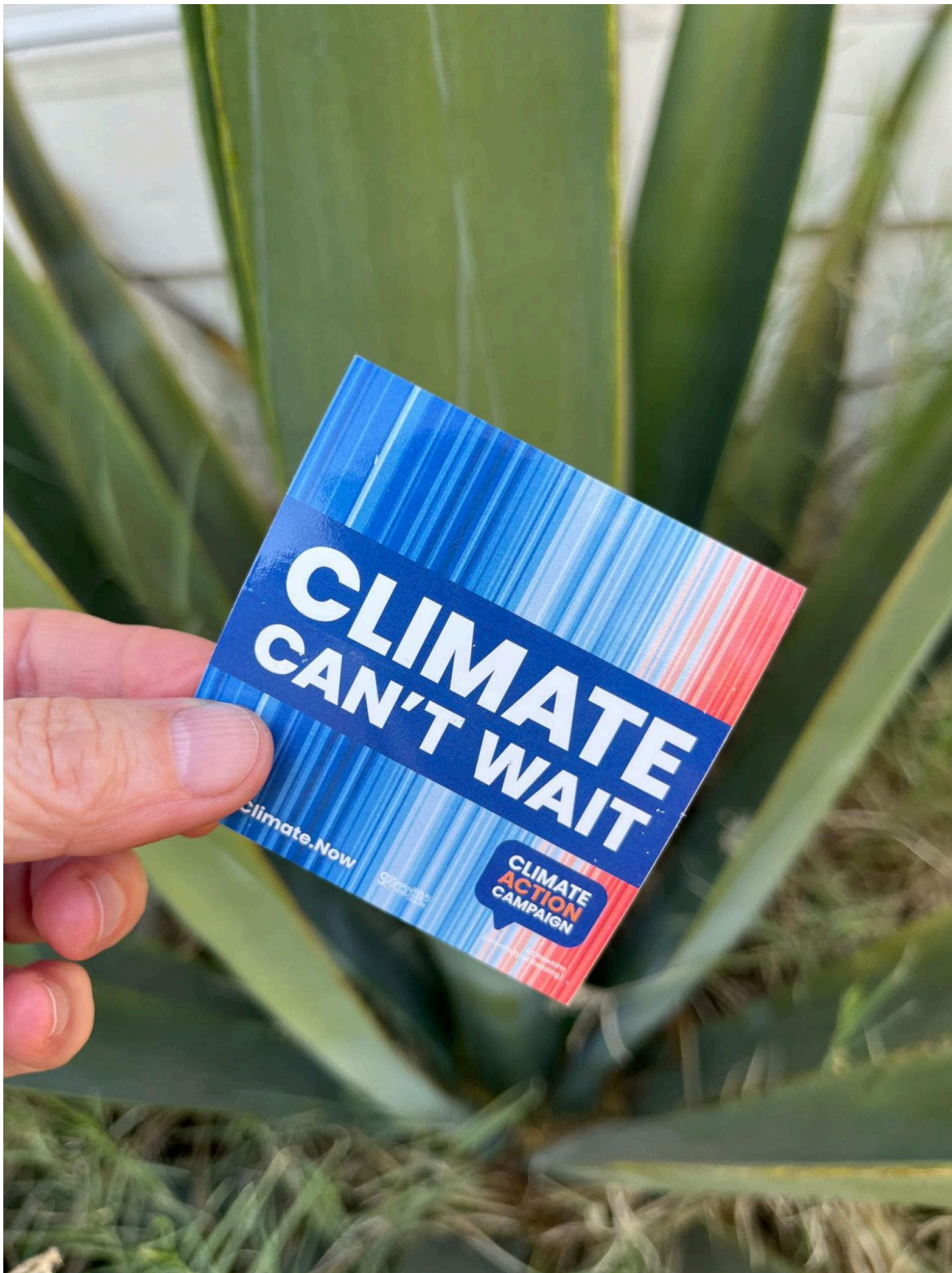
Climate Can't Wait!