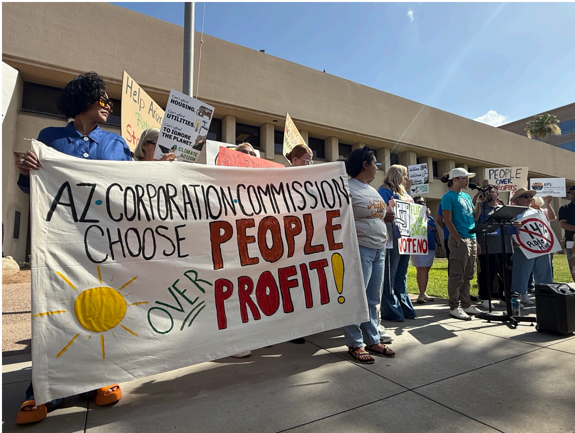
News Conference on the APS Rate Hike