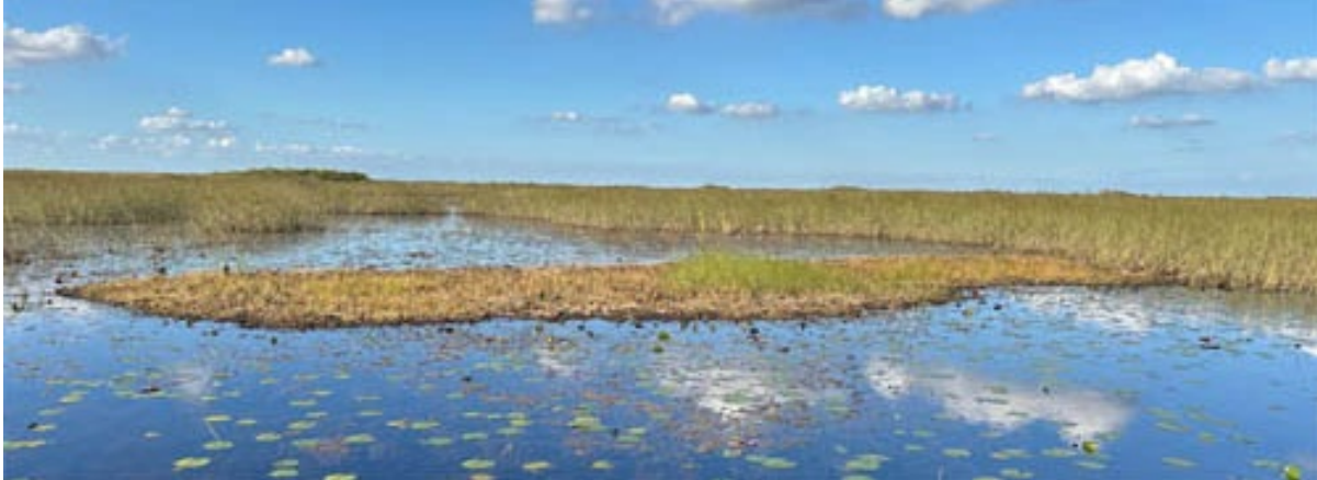
The Everglades

Topic: Rescuing the River of Grass, with Eve Samples