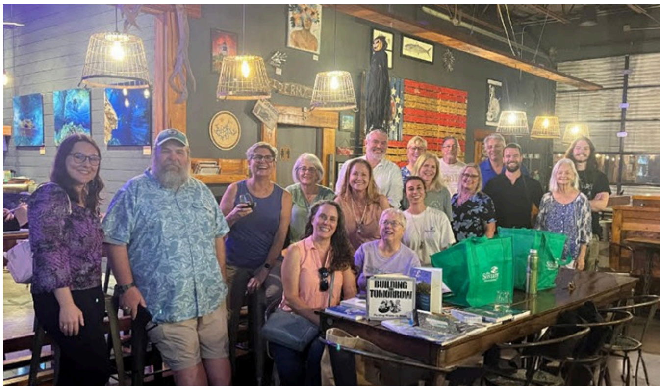
Image: Green Drinks at Marker 48 with Hernando Native Plant Society

Sierra Club Adventure Coast Group is seeking members interested in getting involved. Please consider joining our team. We are seeking individuals interested in protecting our environment, educating our community and advocating to defend it. To learn more, get started by signing up to attend our monthly Executive Committee meeting held the second Wednesday of each month. This is where we discuss and determine how to achieve our annual goals. We are all volunteers and you can choose how much or how little time to engage.