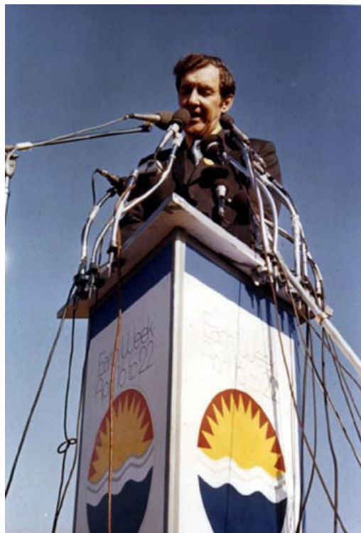
U.S. Sen. Edmund Muskie, author of the Clean Air Act, speaks on Earth Day in Philadelphia on April 22, 1970.

I was born April 21, 1970. My first full day of life was April 22, 1970: the original Earth Day . I have been alive for all the Earth Days and am hopeful for a few more – 56 years of hope and loss.