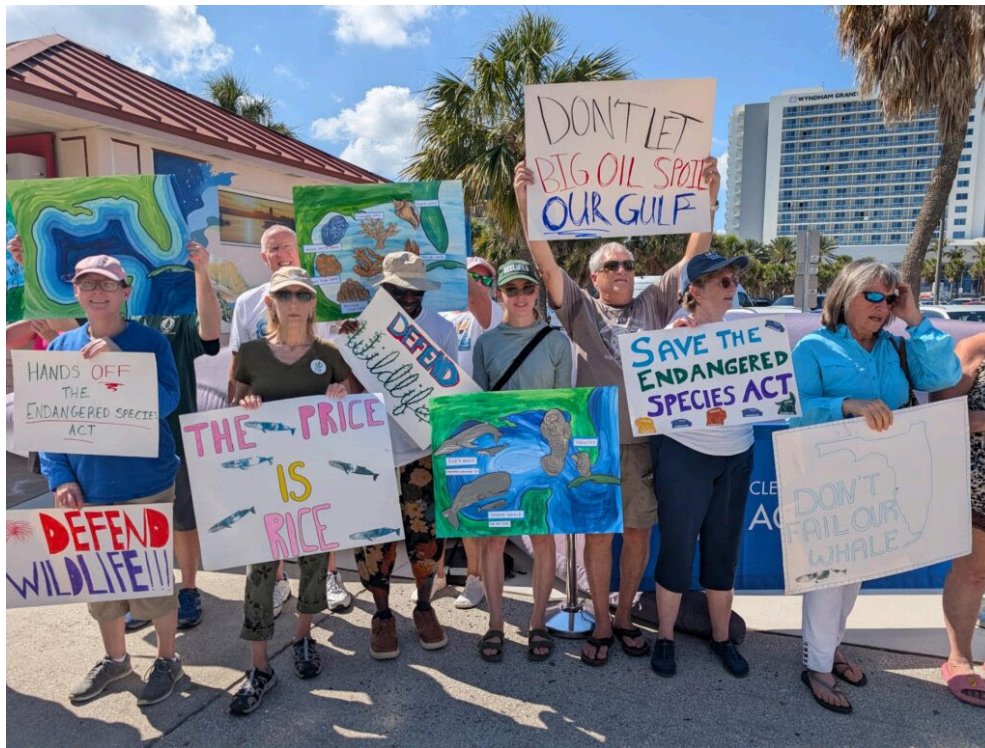
Florida Phoenix | Ahead of Earth Day, environmentalists blast proposal to remove protections for endangered species (4/22)