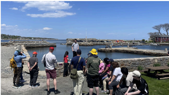
Transit to Trails Rockport Outing.

Check out a few highlights from outings last month 🌱