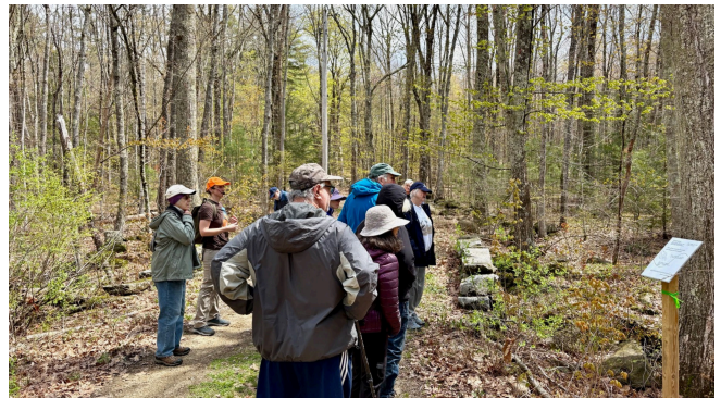
Harvard Forest Outing.