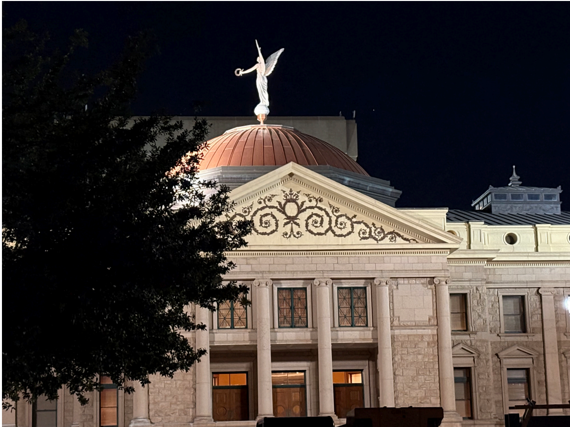
Arizona historic Capitol at night