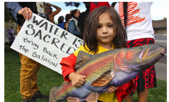
Winnemem Wintu Tribe of Northern California

The Unimpaired Flows Approach is based in empirical, science-backed understandings of ecological conditions and centers Tribal input, community engagement, and transparency in the drafting and implementation of the Plan.