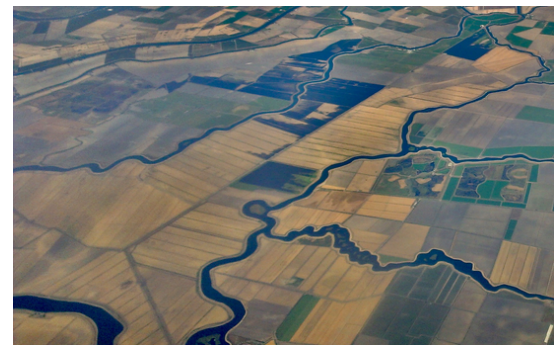
The San Francisco-San Joaquin Bay Delta Estuary

While CNRA initially attempted to include Tribes and environmental orgs in early negotiations, these crucial stakeholders abandoned the process because of a hostile environment where they were “wholly shut out of the conversation,” with confidentiality agreements that “shielded the negotiations from public input and shrouded them in secrecy.”