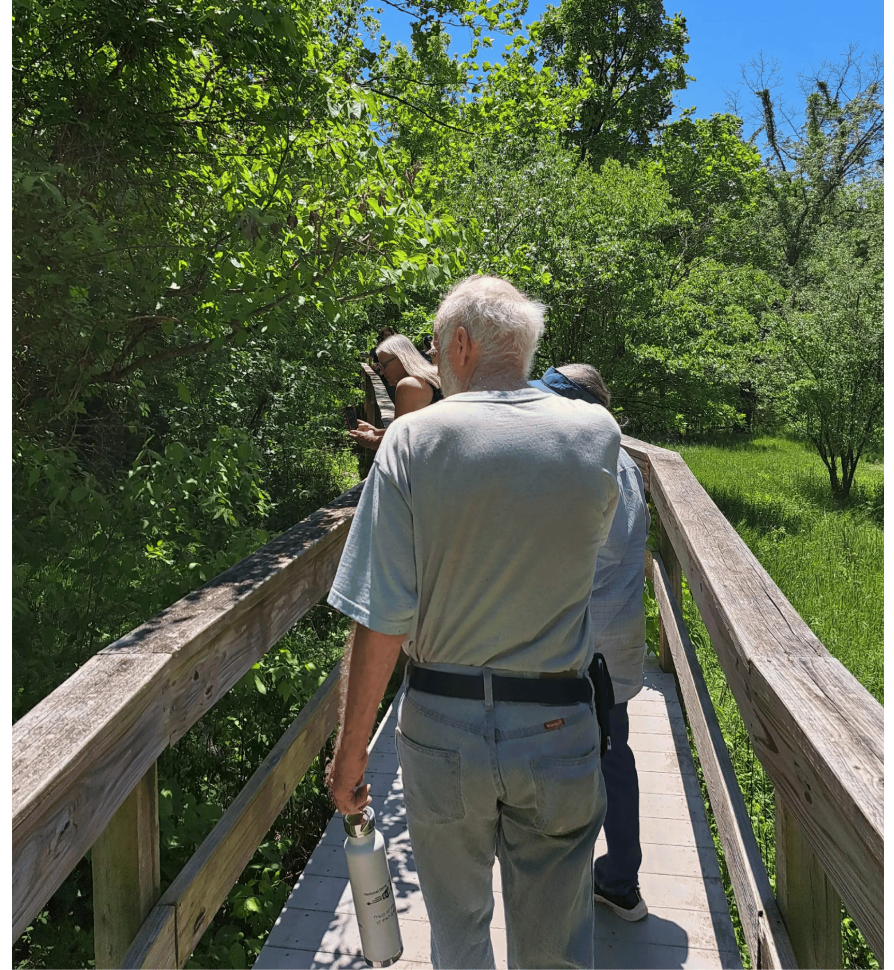
Kanza Network May Walk & Talk