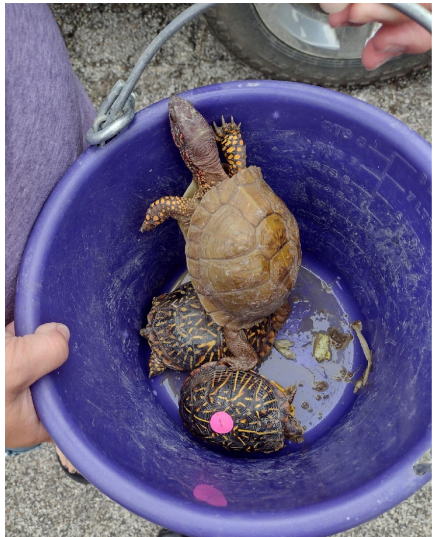
Severy, KS Turtle Race Labor Day Weekend 2025