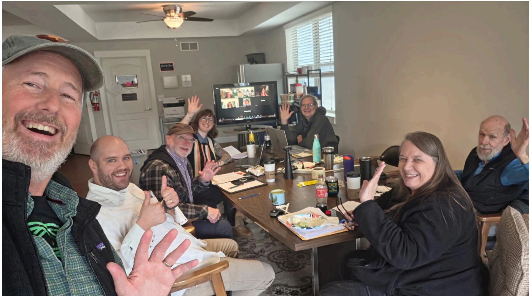
Chapter ExCom Meeting in April 2026

We encourage members from across Kansas to consider running for leadership positions within the Kansas Chapter Executive Committee (ExCom) and our local groups: the Southwind Group, Wakarusa Group, and Flint Hills Group.