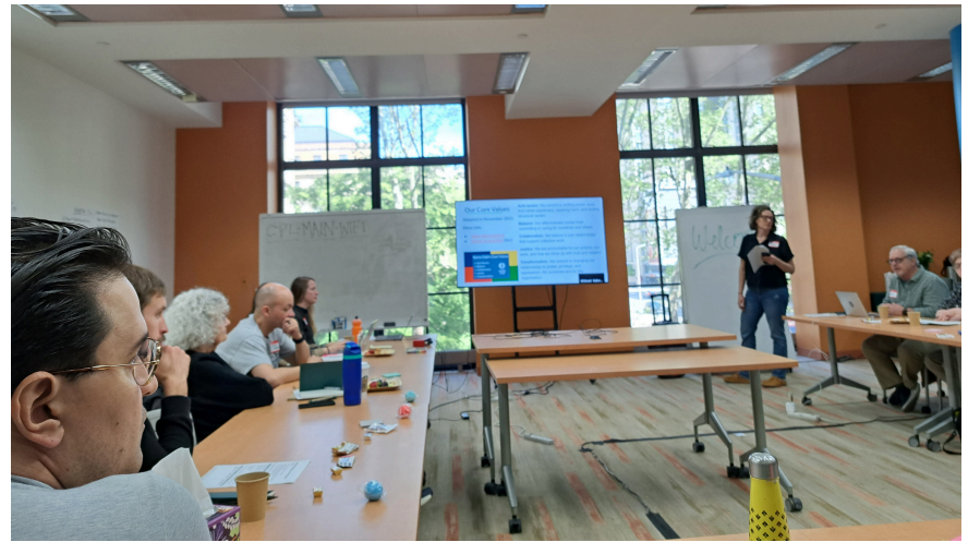
Sierra Club staff and volunteers in Cleveland, Ohio for the Midwest Regional Gathering