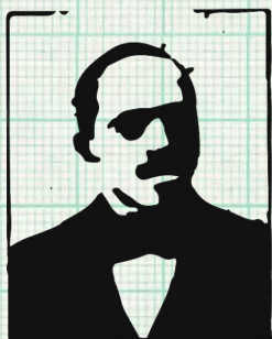
W. E. DUBOIS