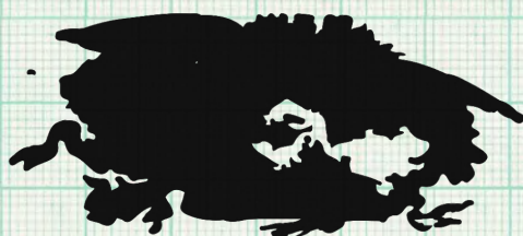
HEADQUARTERS OF THE