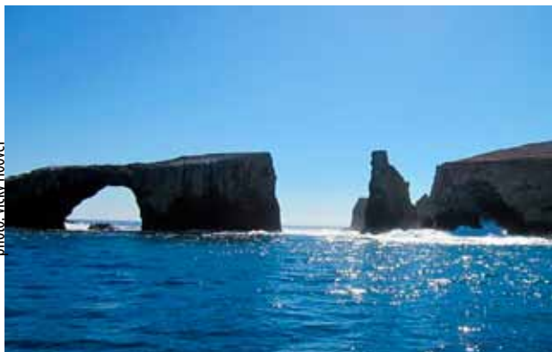
Famed Anacapa I. arch is a Channel Island National Park symbol

Channel Island's wilderness proposal shows there is hope ahead. ♪