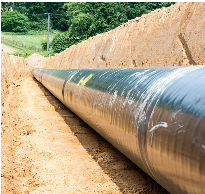
The proposed Atlantic Coast Pipeline would generate an estimated 68 million metric tons (MMT) of carbon dioxide equivalent every year

The production, processing, storage, transmission, and distribution of fracked gas leaks immense amounts of a dangerous greenhouse gas into our atmosphere. Unburned fracked gas consists primarily of methane, and while carbon dioxide remains in the atmosphere for longer than methane, methane has a much stronger climate warming effect. When its impact is averaged over a 20-year period, methane leaked directly into the atmosphere is 87 times more powerful at trapping heat than carbon dioxide. 9