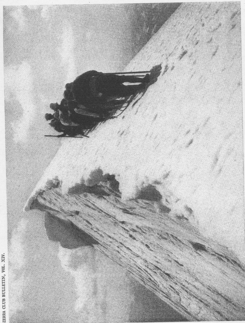
SIERRA CLUB PARTY AT THE SUMMIT OF MOUNT RESPLENDENT

wonderful view from their own camp-site. Here a promontory, almost an island, extends out from the shore of Lake Adolphus. The storm of the last few days had suddenly cleared, leaving the waters of the lake beautifully calm. In them, throughout the long twilight were reflected the lofty peaks of Robson and Whitehorn with their ever-changing fleecy cloud-mantles. Two huge camp-fires burned cheerfully. Our violinist went up the shore a short distance to a vantage-point from which his music was more wonderful than ever. The thoughts of many of the party turned naturally on this occasion to the kindly sympathetic leader who has planned and led all of the Sierra Club's twenty-seven outings and to what he has done for the club, and through it for all lovers of the great outdoors.