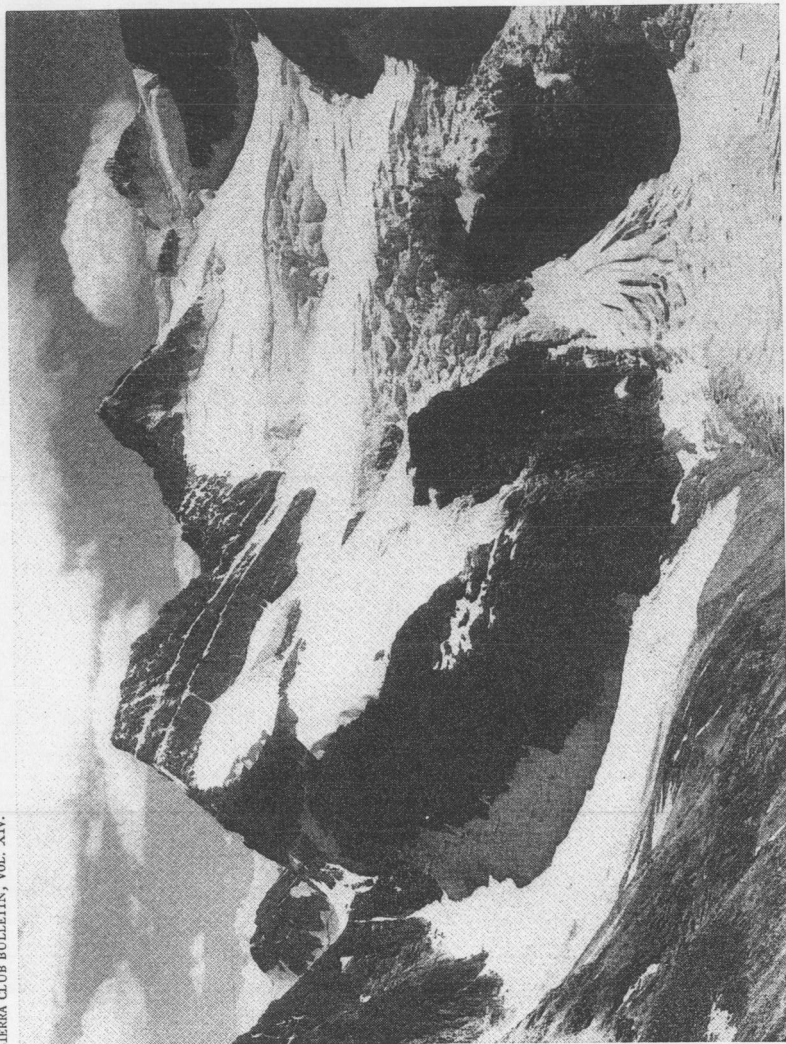
HEAD OF BENNINGTON GLACIER

and to the east of these peaks, was the objective of other expeditions.