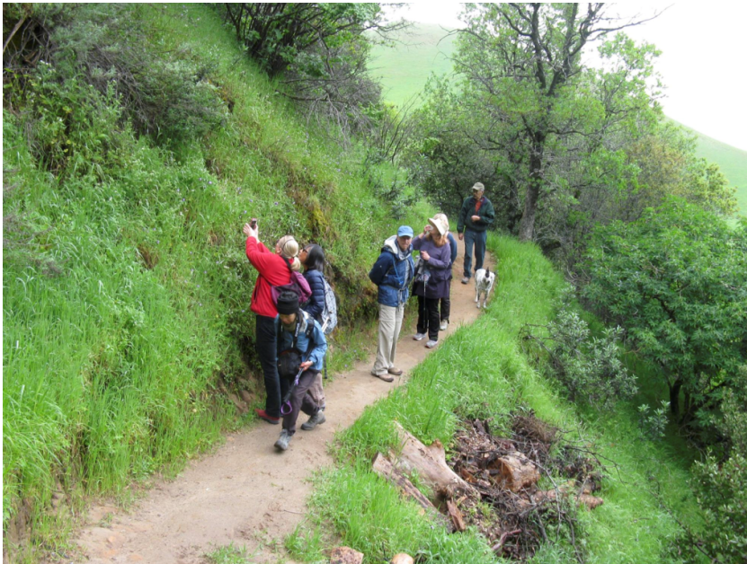
Unpaved narrow trail

Walkers, Hikers, Joggers, and the occasional horse rider should not expect to encounter a mountain bike rider on park narrow trails unless posted for bike use on a few board approved (21) trails that usually provide connections to wide multi-use trails.