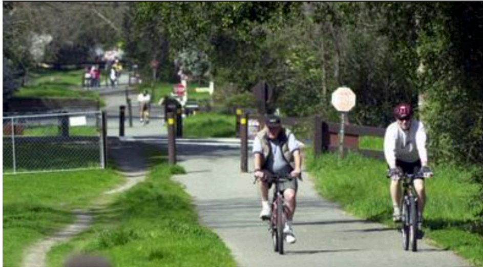
Paved Regional Trail

The District has 46 years of experience (1971 to 2017) in its system of trails that now include 26 paved or unpaved multi-use Regional Trails that accommodate all users (hiker, horse, bicycles, and wheelchairs) and currently total approximately 200 miles. Regional Trails are usually intended and designed for multi-use (hike, horse, and bike), but there will obviously be urban sections of trail for hike and horse only with bikes on city and county roads, and there are areas where sensitive resources prevent all three uses in the same corridor.