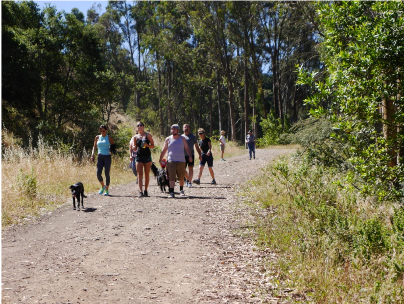
Unpaved wide multi-use trail

The District has 80 years of experience (1937 to 2017) with hiking and equestrian use in its system of trails that now include 200 unpaved narrow Park trails that were constructed for (hikers and equestrians) and currently total approximately 150 miles, mostly short in length trails that are often located in sensitive resource areas or along steep terrain. Some narrow trails are designated for (hikers only).