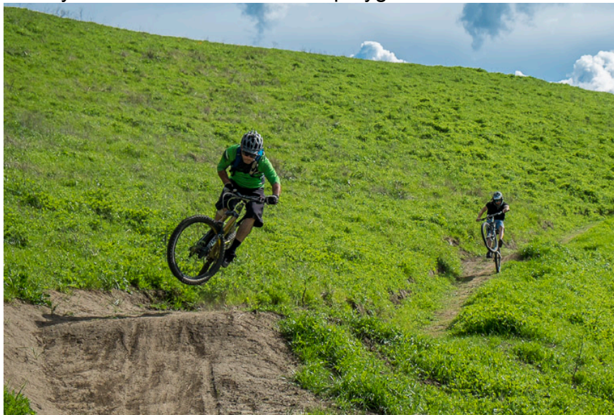
Single-track pump flow trail

“Several custom built single-track trails have been designed and constructed by the Bicycle Trails Council of the East Bay along with the architect of single-track trails, Nat Lopes of Hilride and by Sweco operator Jim Jacobsen. These trails were designed and specifically built for mountain biker riders who want a unique downhill flow experience. We not only have a new riding spot in the East Bay, but it’s a legitimate single track trails destination. Rollers, berms and even table top jumps offer options for getting rad and even take to the air. A few months ago, this was just another grassy hill in the east bay. Now it’s a mountain bike playground.”