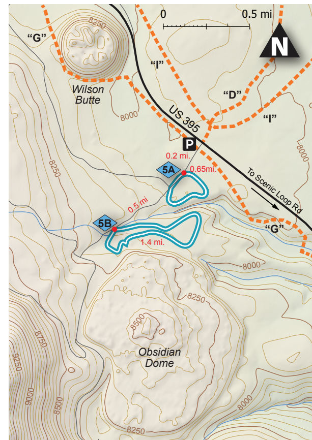
Inset Map: Obsidian Dome Routes