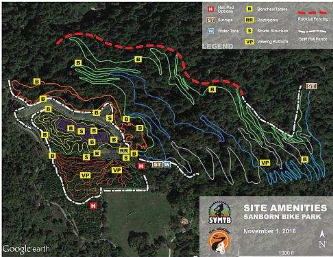
Exhibit "A" SVMTB proposal