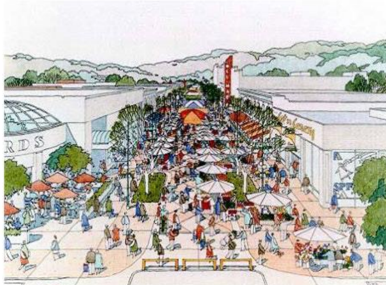
... will be transformed once a week into a Farmers Market. can be transformed for special occasions and events.