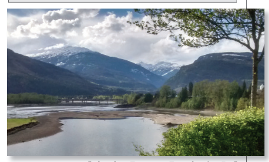
Columbia River at Revelstoke, BC

The Sierra Club has extended its COVID-19 operational response through Sunday, July 4, 2021. This means all national, chapter, and shared offices will remain closed, with rare exceptions for urgent business.