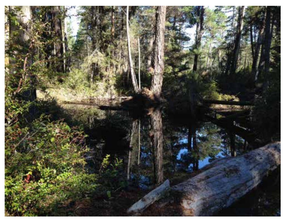
The proposed site within the Mendocino Pygmy Cypress Woodlands for a garbage transfer station.

It is difficult to take a simple look at the Mendocino Pygmy Cypress Woodland. Once looked into, a