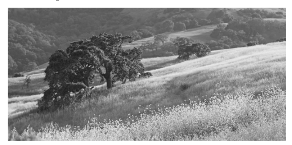
Urban Growth Boundaries are lines around a city beyond which urban development is not allowed. The UGBs help preserve our native habitat, such as the oak woodlands that surround Sonoma Valley.

Unfortunately, a few housing advocates and developers are saying that we should expand into the greenbelt. They use the same stale arguments from two decades ago that sprawling out is the answer to housing needs. The rest of the Bay Area demonstrates that sprawl does not provide affordability.