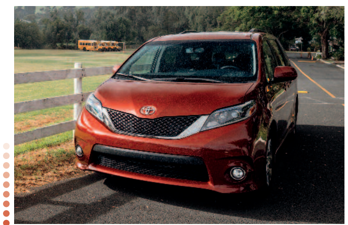
2016 Toyota Sienna