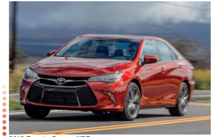
2016 Toyota Camry XSE

Vehicles are displayed at the discretion of the manufacturer. Vehicles shown here may not be displayed and are subject to change without notice.