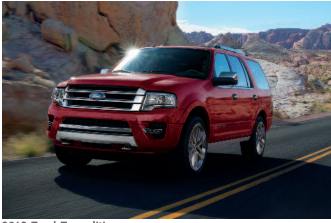
2016 Ford Expedition