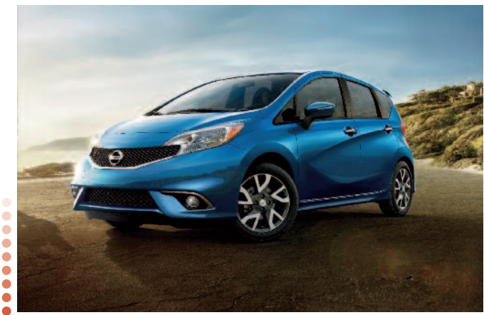
2016 Nissan Versa Note