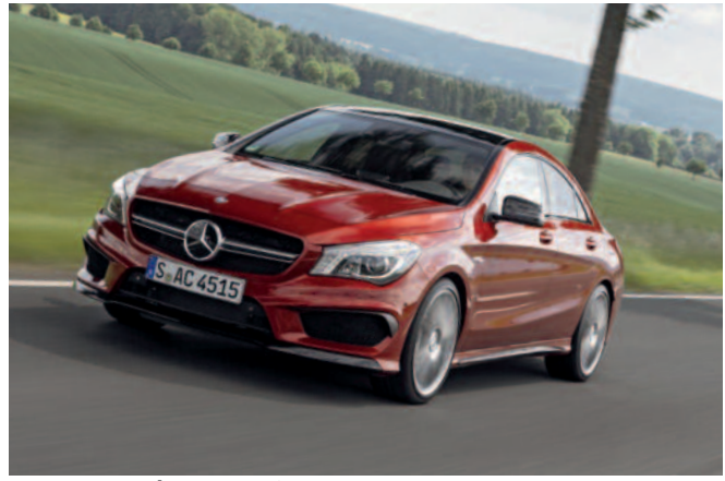
2016 Mercedes-Benz CLA