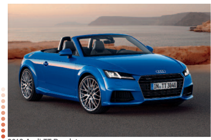
2016 Audi TT Roadster

Mazda MX-5 Miata Mercedes Benz E-Class Mercedes Benz SL Roadster Mercedes Benz SLK Roadster MINI Convertible Porsche Boxster Porsche 911 Volkswagen Beetle Volkswagen Eos