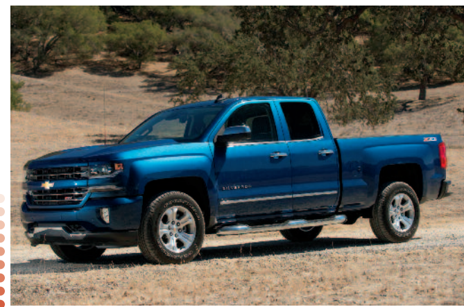
2016 Chevrolet Colorado Diesel