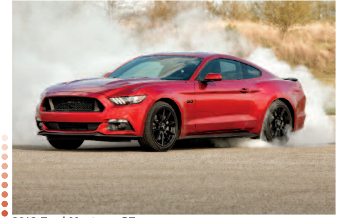
2016 Ford Mustang GT