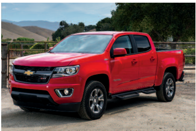
2016 Chevrolet Silverado Diesel