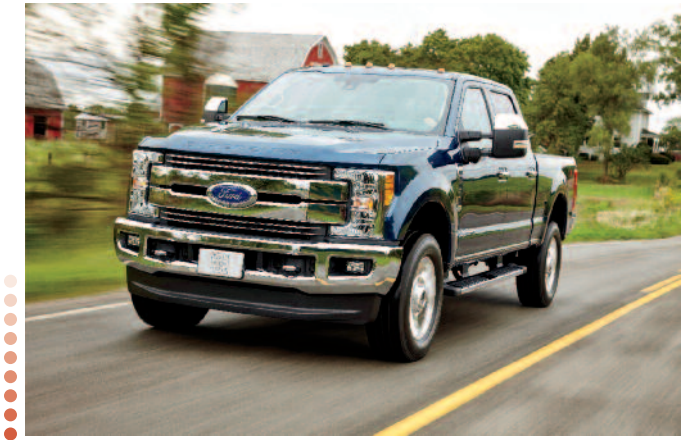
2016 Ford Super Duty