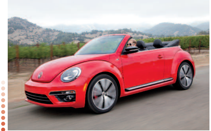
2016 Volkswagen Beetle