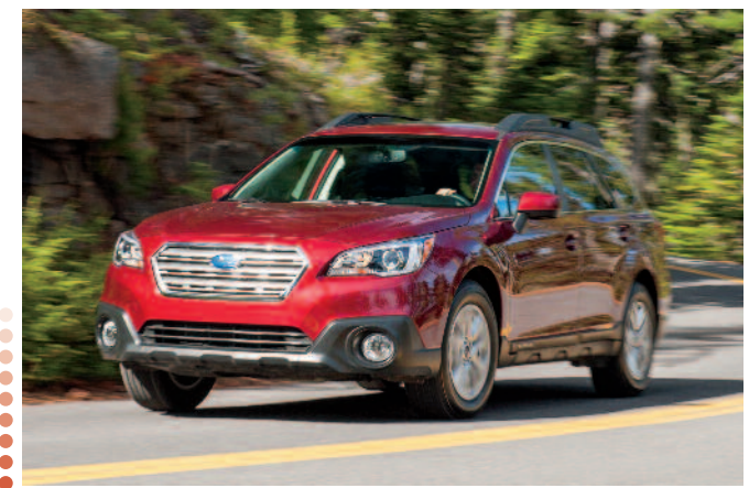
2016 Subaru Outback