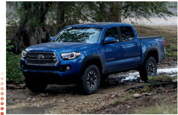
2016 Toyota Tacoma