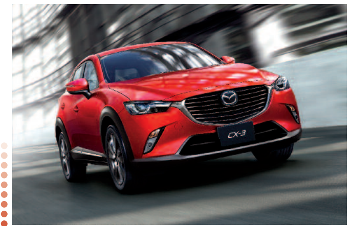
2016 Mazda CX-3