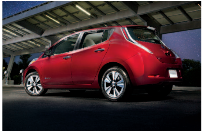
2016 Nissan Leaf