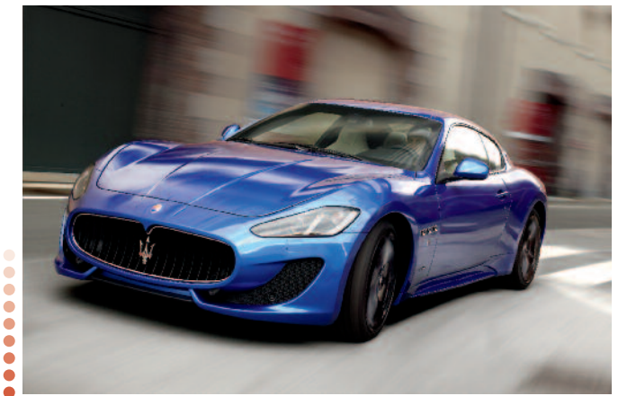
2016 Maserati Gran Turismo