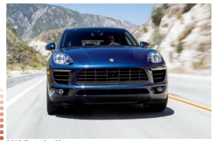
2016 Porsche Macan