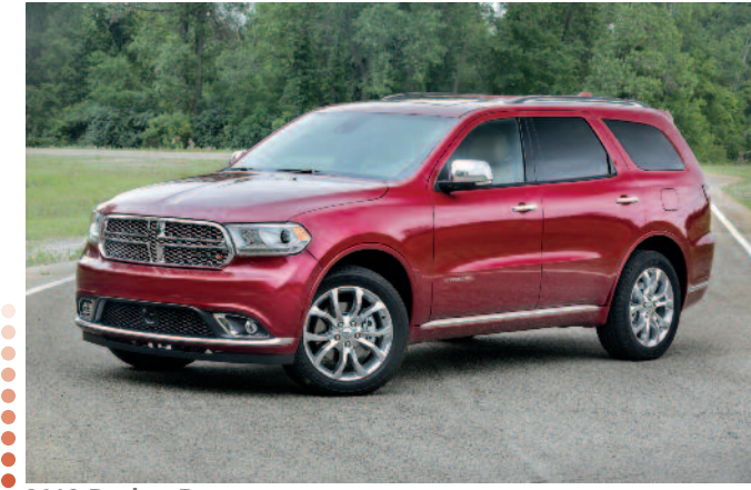
2016 Dodge Durango