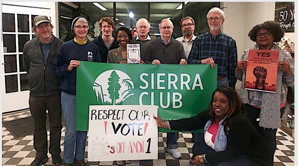
Sierra Club members show their support for Clean Missouri on January 15.

We believe that voters should choose which politicians we want, NOT that politicians should choose which voters they want. Our democratic system is based on the notion that Legislature should respect the will of the voters. That value will be tested in the upcoming Legislative session, which begins on Jan. 8, 2020. The Sierra Club needs