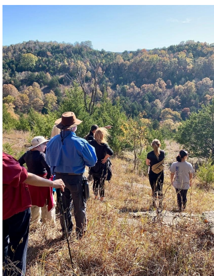
Hiking tour of Ozark Mountain State Park on November 3.