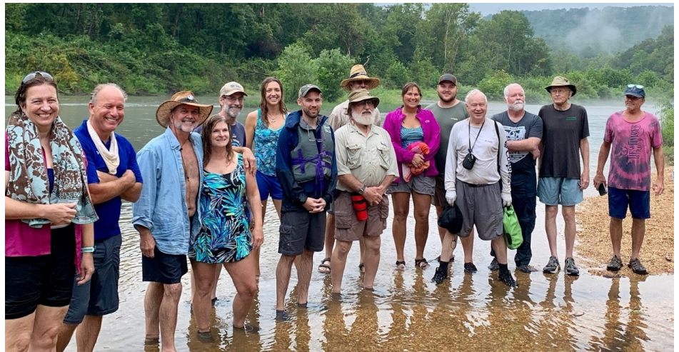
Sierra Club leaders from around Missouri gathered on August 24 & 25 for our Public Lands Retreat to plan to protect public lands and to enjoy the spectacular beauty of the Current River.

These limits allow plenty of opportunity for motorboats on the Current River in the summer in the 50